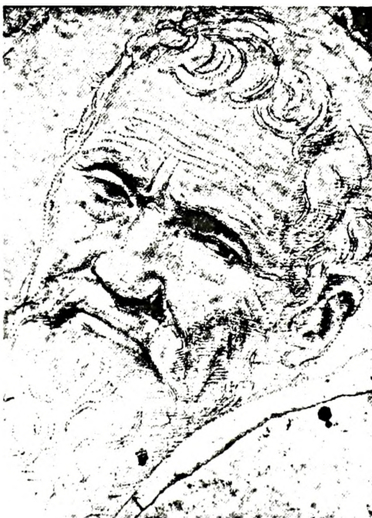
FIGURE 1. Daniele da Volterra, Michelangelo . Condivi, frontispiece.

Ascanio Condivi, a student of Michelangelo, wrote his biography in 1553, eleven years before Michelangelo's death at nearly eighty-nine in 1564. In a prefatory statement to the reader, Condivi points out several important fea-