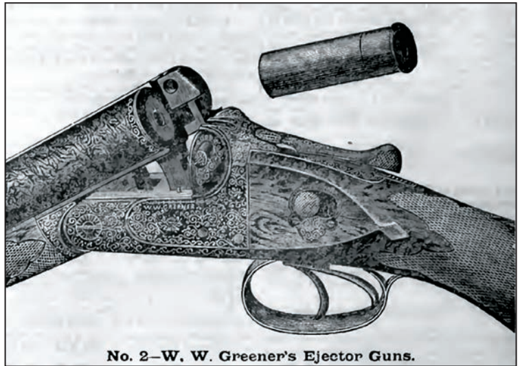
No. 2—W. W. Greener's Ejector Guns.

Stark's sold many models of shotguns. The company marketed inexpensive models for farm use, while targeting wealthy 'sportsmen' with pricier models, such as those produced by English manufacturer W.W. Greener. Note the intricate design which made the firearm an appealing consumer item that bestowed status on the purchaser. Source: Stark's catalogue, c.1889, 182.