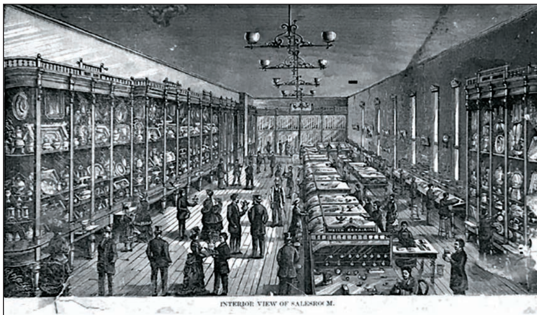
INTERIOR VIEW OF SALESROOM.

This image of the sales room of Stark's highlights the company's houseware, watch, and firearms business.