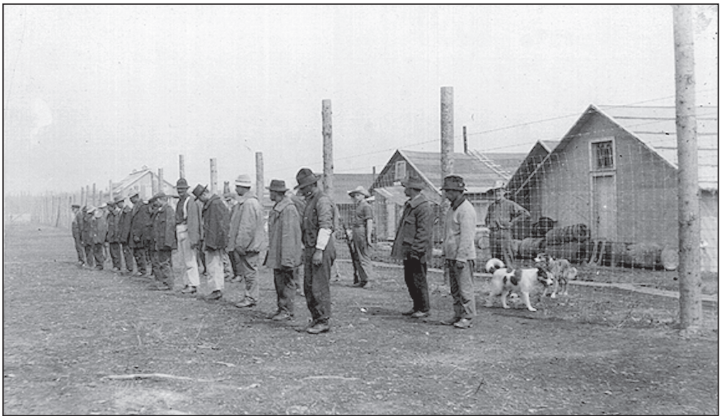
Prisoner roll call, Kapuskasing Internment Camp.

remaining prisoners, still compelled to work, drove railway spikes into the logs, damaging the mill's saw. These and other acts of defiance were seen as signs of sedition on the part of the enemy alien, the handiwork of those who could not be easily accommodated or integrated. Although their fate was still to be determined, removal to a secure site was a foregone conclusion. Kapuskasing's isolation, capacity to intern large numbers, and proximity to transport made it a preferred location. 30 Kapuskasing would thus serve as a destination for those prisoners who either resisted or were considered suspect. Given the perceived danger they posed, instructions were issued to reinforce the existing wire compound at Kapuskasing with two additional tall fences, set six feet apart, around the pe-