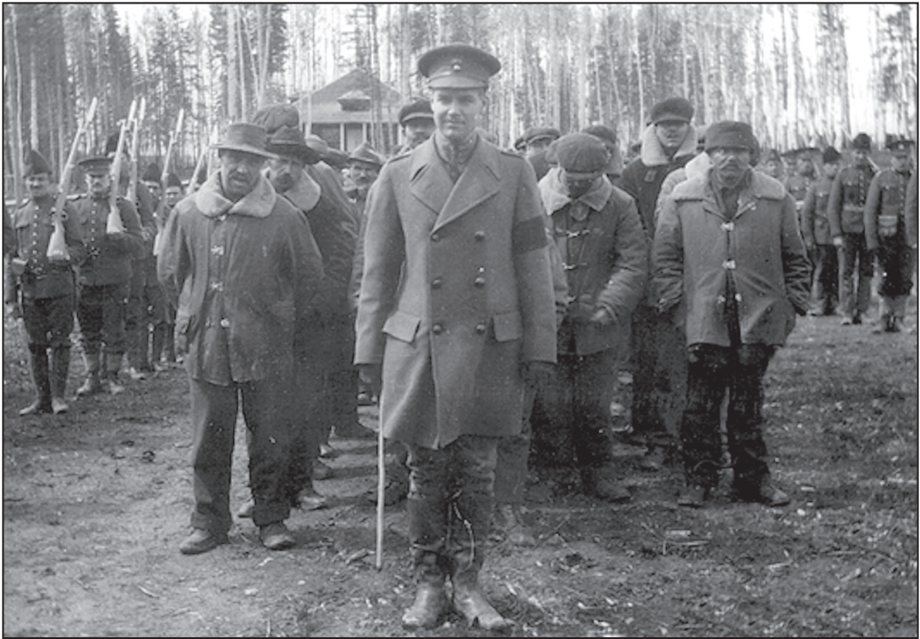
Prisoners on parade, Kapuskasing Internment Camp.

work “of troublemakers, obstructionists, agitators, who are always talking ‘Hague Rules,’ etc.” 39