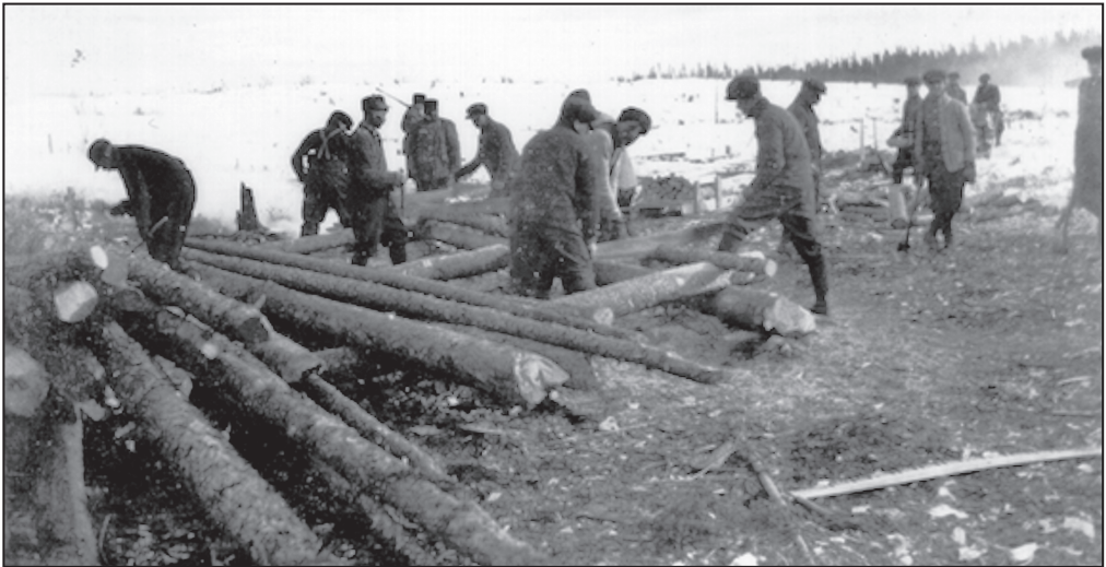
Prisoners at work, Kapuskasing Internment Camp.

puskasing was a place where, designated as POWs, civilians were forced to work under armed guard, and, isolated and forgotten, endured primitive, harsh conditions. It was also a place where, once deemed unwanted, they would be held until deported. More to the point, Kapuskasing was a place of moral, physical, and psychological danger, where indifference, suspicion, and malice came together to shape the experiences of those interned as well as those tasked with overseeing their internment. Underlying much of this was the predicament of immigrants originating from distant lands now at war with Canada. There was a tangible sense they did not belong. In the context of war, in which birthright became paramount, they were designated and treated as enemies. This was no small matter, affecting their everyday lives.