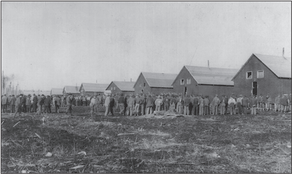
Prisoners assembling, Kapuskasing Internment Camp.

brought to the level of the Hun,” he declared. 15 But the director also understood that in the wilderness, there was little he could do if immediate and proper supervision was lacking.