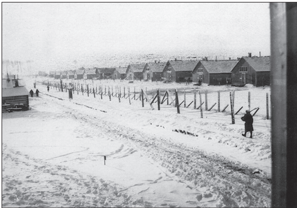
Guarding the perimeter, Kapuskasing Internment Camp.

ally driven back to their bunkhouses. In the confusion, reports indicated a number of prisoners were shot and killed. In the end, twelve were seriously injured. 23