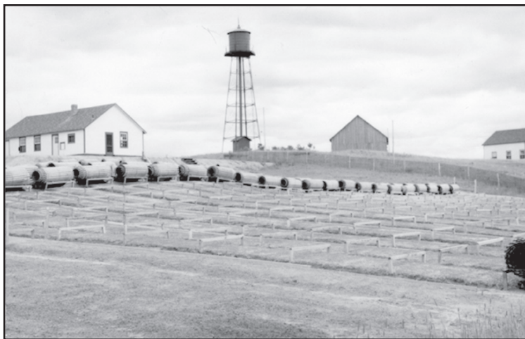
Image 2: Spruce Falls' Tree Nursery in Moonbeam. The nursery's infrastructure included a water tower, numerous buildings, and seeding and transplant beds. The former were the sites in which the tree seeds were first planted. To help the seedlings grow and their soil remain moist, they were protected by rolls of snow fencing that were unraveled and suspended on simple wooden braces that were spaced along the beds. The fences are coiled up and run through the centre of this photo, and their wooden supports are visible over most of the beds.