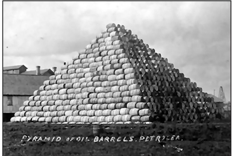
“Pyramid of Oil Barrels at Petrolea,” (Lambton County Archives).

in 1862 on the outskirts of Oil Springs, spiked production of Enniskillen oil to such an extent that it started outpacing domestic consumption. Producers responded by shipping oil to Britain in the spring of the same year. 13 At first, the increasing amount of oil did not pose a