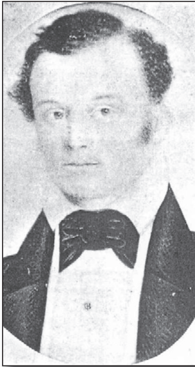
Nils von Schoultz

the border that believed the loss of Canada would be a mighty blow against the British Empire and, like all of the others, the Hunter Patriots found out too late that their plan would never succeed. Some have claimed that, had it not been for the tragic loss of life during those five bloody days in November 1838, the entire scene would have made for a delightful comic opera; the exact same sentiment has been applied to the Fenian invasions of 1866 and 1870. 4