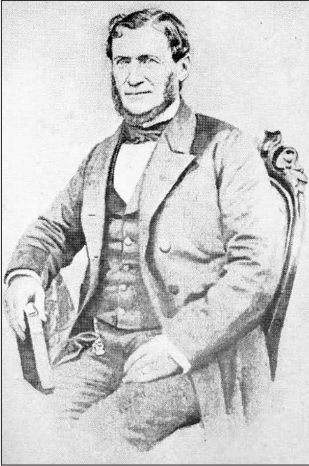
Ogle Gowan from Robertson's Landmarks of Toronto, 1913.

manliness to analyze the events at Windmill Point and their legacies. It has long been doctrinaire in gender studies to define masculinities as being both multiple and fluid. Created in specific temporal and spatial settings, they are identifiers of social status and privilege that are forever changing, needing to be tested, demonstrated, and proved in order to carry cultural influence in a given society or community. 5 While Irish women have received some attention from a Canadian perspective, gendered histories of Irish masculinities in Canada are virtually non-existent. 6 In the nineteenth-century British world, a heroic form of manliness was central to the image of an ideal man, incorporating es-