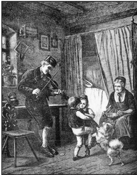
"The First Waltz," The Canadian Illustrated News , 13 August 1870. Library and Archives Canada , C-050359.

and grace—and dress could give—Rank and honourable status to be sure were conspicuous, but all were made perfectly easy and delighted with the soft strains of music—and when the waltzing struck up ... it is not surprising that sober country people" one assumes like himself,