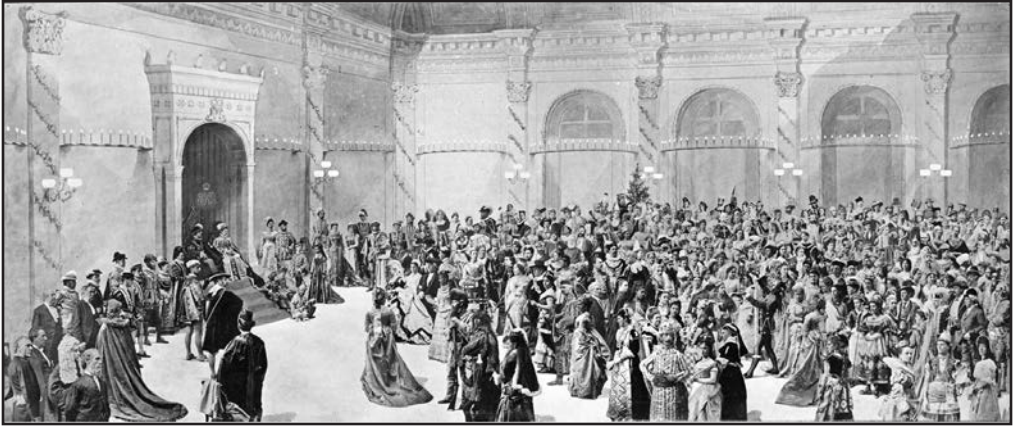
"The Governor-General's Fancy Dress Ball"

my departure from Toronto is not what I anticipated." Although she would not miss York itself, she would miss her new friends. 96