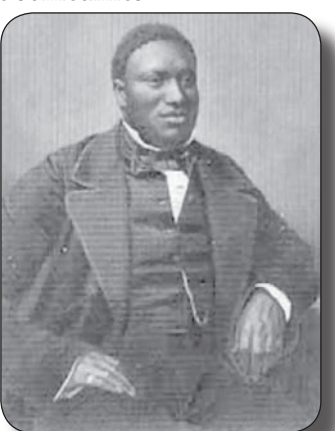
Samuel Ringgold Ward. From Samuel Ringgold Ward, Autobiography of A Fugitive Negro, His Anti-Slavery Labours in the United States, Canada, & England (London, 1855).