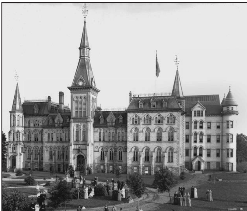
Alma College in 1891.

Day students were welcomed as early as 1907 and a junior school for girls under thirteen was formally opened the same year though, as early as 1899, the College was enrolling students in its “Preparatory Department,” whose course of study included “Public School” grammar, arithmetic and geography. By 1920, the Junior School curriculum had been brought essentially in line with the standard course of study taught in the province’s