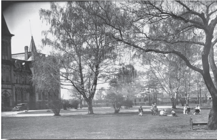
Alma College Art Class.

the social history and commercial development of the city of St. Thomas and Elgin County, as the records provide voluminous information about local events, institutions, businesses and individuals through their interaction