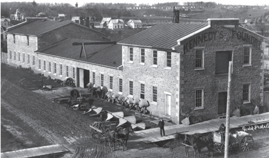
William Kennedy & Sons Co. Foundry at the corner of Stephens St. and Beech St. (now 1 st Ave. West and 11 th St. West). Notice the wooden patterns located along side the building. Also of note is the wooden boardwalk used as a sidewalk. This photograph dates c.1900.