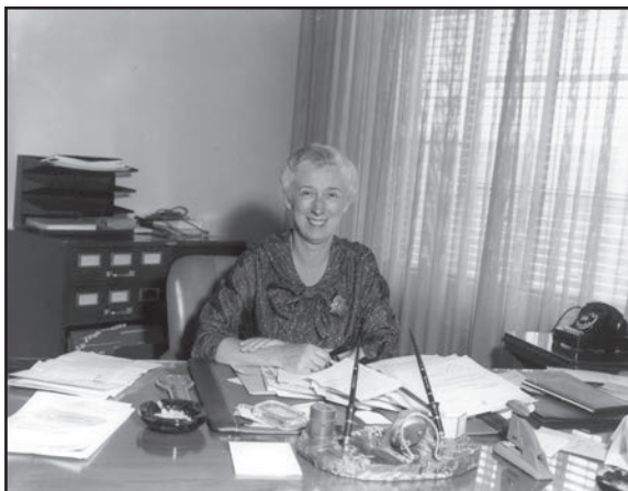
Ellen Fairclough.

Collection consists of manuscript and archival records relating to Hamilton and the Hamilton-Wentworth area including records of local businesses and organizations, family papers, government records of the City of Hamilton and the County of Wentworth, military records, etc.