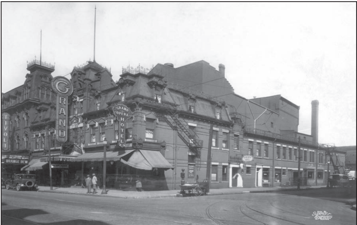
Grand Opera House.

For more information see www.myhamilton.ca/myhamilton/LibraryServices/Localhistory/Pringle+Papers.htm