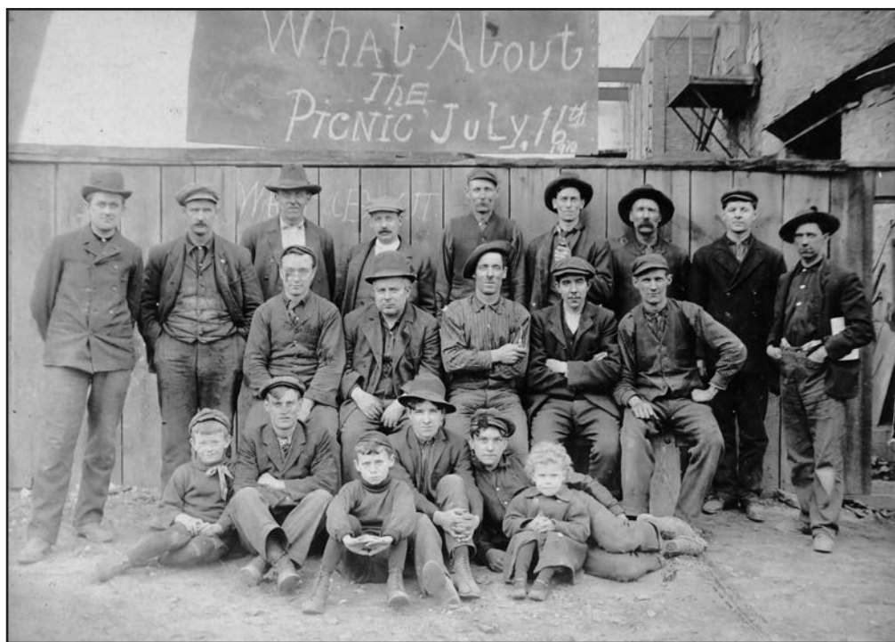
Men and boys employed at the Kennedy foundry, 1910.

ingly scarce. As a result when munitions production at Owen Sound began to slip in 1917 the Collingwood foundry made up the difference, aided by Kennedy's installation there of its first electric furnace capable of producing fifteen tons of pig iron daily. 13