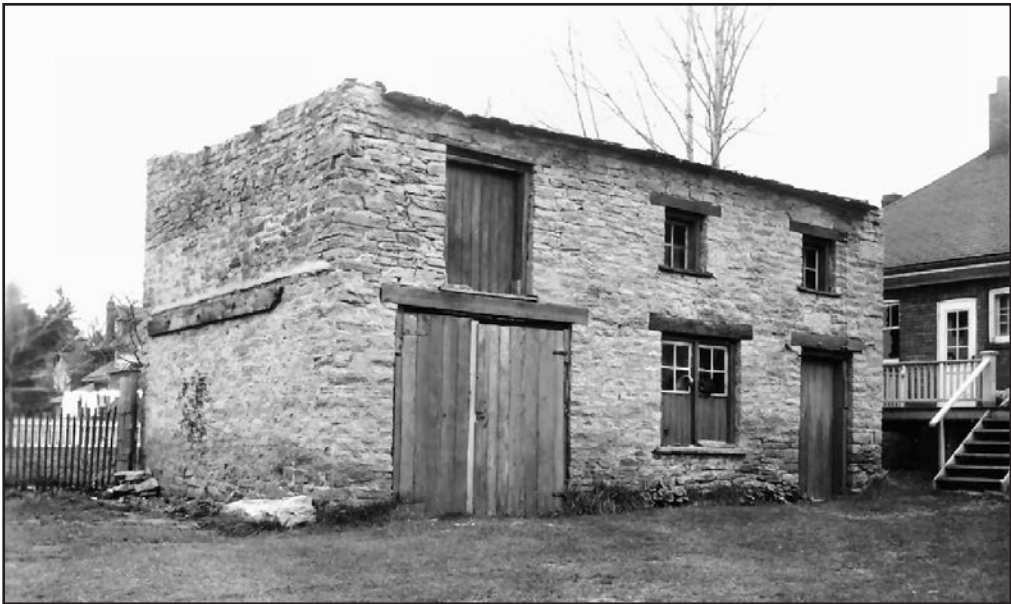
The second Kennedy foundry building.