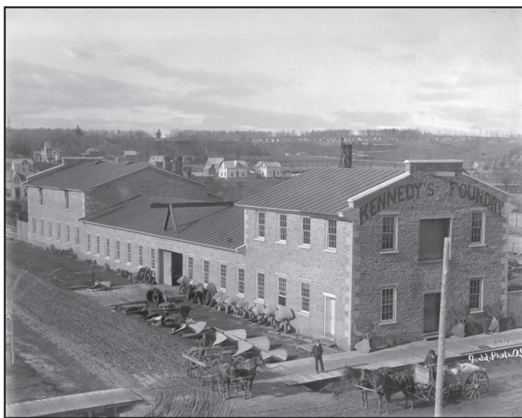
The Kennedy foundry, circa 1898.

dent Baptist and “advocate of temperance principles.” Having “embarked in the foundry business in a small way,” he had converted his entrepreneurial talents into “a large and prosperous business” by virtue of “close attention and a through [sic] knowledge of the requirements of the trade.” 9