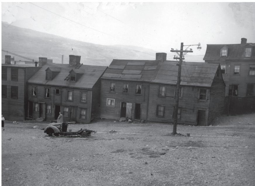
Photo 1: This undated photo shows a woman looking towards the Southside Hills from Cuddihy Street. The current St. John's City Hall is located near this area.