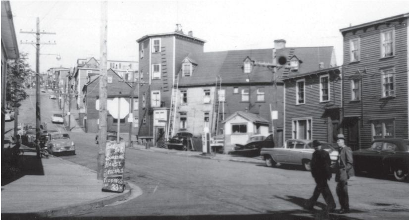
Photo 3: This photo (c. 1950s) shows two men crossing west on New Gower Street at Springdale Street towards a grocery store. The area behind and to the north of the two men is the current location of the parking lot of the Delta Hotel. The author grew up in this area in the 1960s and 1970s.

that was left of the residential area discussed in the opening paragraph of this paper. This was after NIP and RRAP funding for some of these residents.