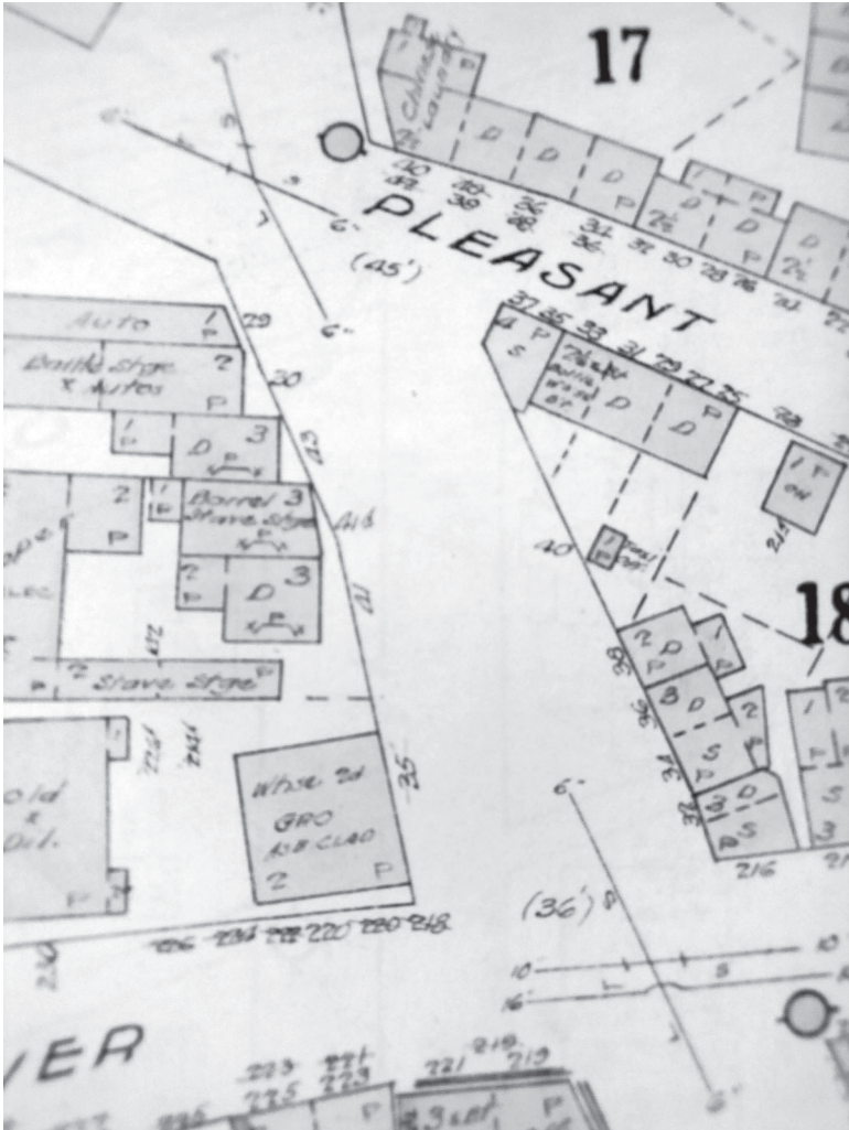
Map 3: This map shows the area depicted in Photo 3.

The need for subsidized and low-rent housing did not disappear with the slum clearance of the 1960s and the NIP and RRAP programs. In fact, Bacher (1993) argues that the latter had the ironic effect of inflating housing prices and further displacing low-income earners. And, as we have seen, the Cabot Place Development removed even more low-income earners from the little