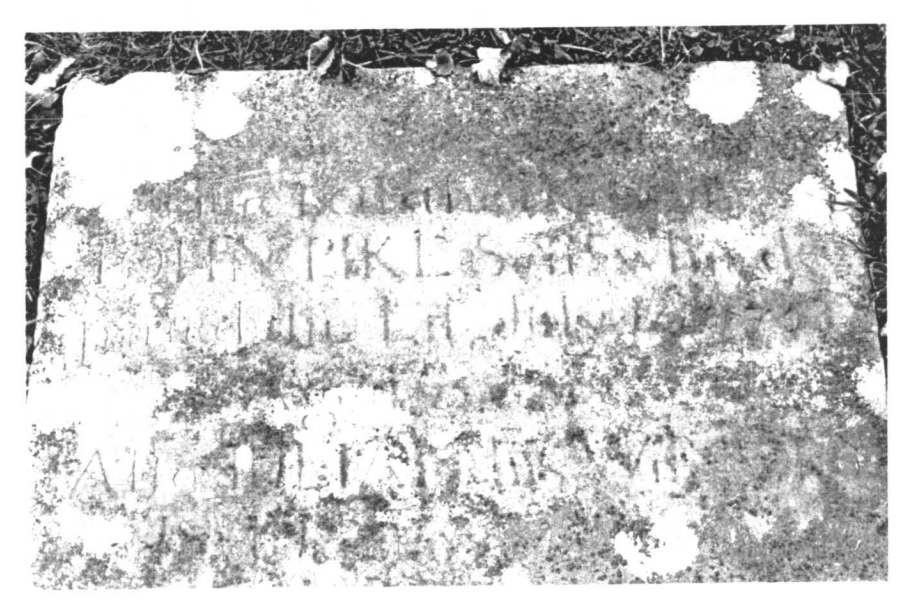
Pike stone inscription.