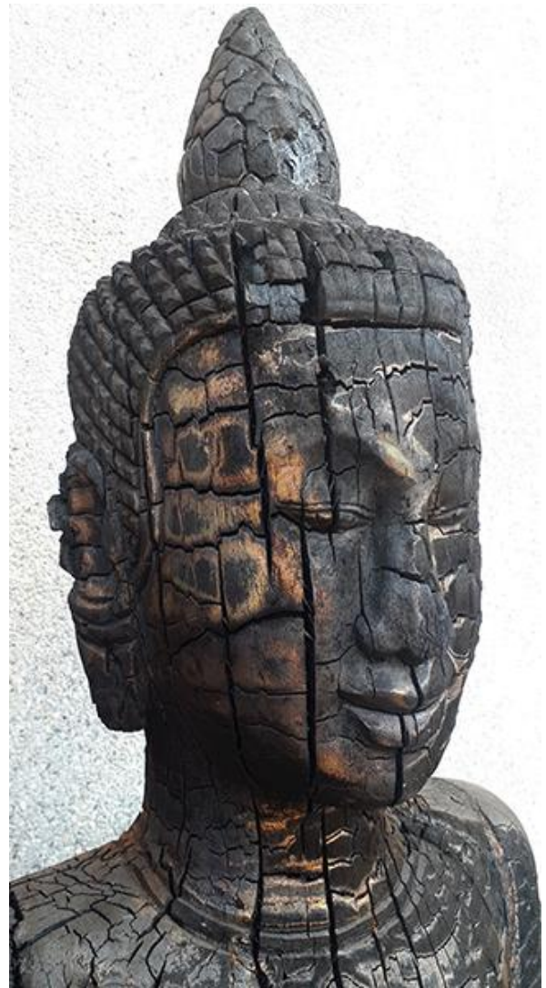
Charred Bodhisattva, Phnom Penh, Cambodia, Feb. 2020

But La Peste seeped in. Our bubbles were breached. Nature reached in to remind us of our mortality. Gaia reminds us that at any time she’ll strike us with unmitigated turmoil.”