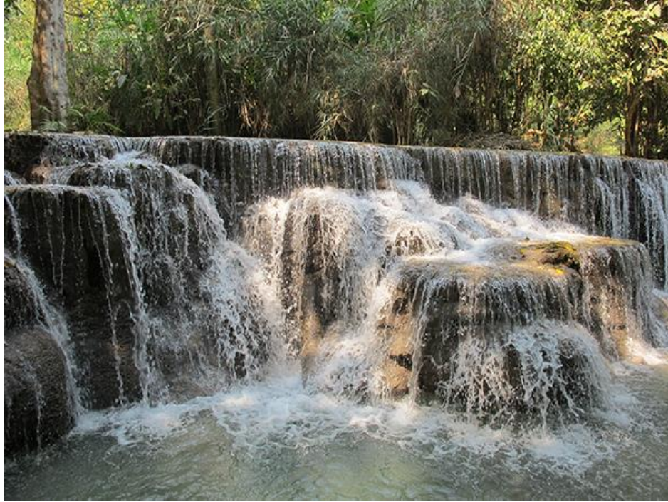
Kung Si Waterfall, Laos, Feb. 2020

Intolerable insolence, in the section called “Fractals on Surrender Row (A)” encourages “Necessary resistance: against a life without inspiration.” And later in this “Discarnate Rock Opera”: