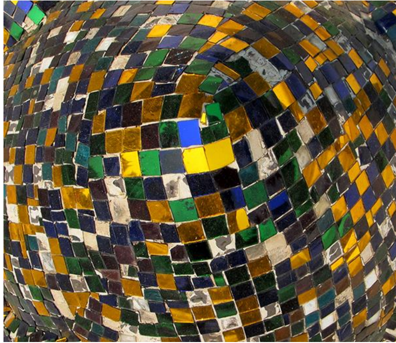
Breakthrough Mosaic, Luang Prabang, Laos, Feb. 2020

Powe updates Rimbaud's "One must be absolutely modern..." to catch the flight of the zeitgeist: "Rimbaud's insistence: be in the now, become instantaneous. Your century will fill you with its emotions, its inconclusive voyaging." We piece together the tesserae artfully to forestall the forces of fragmentation and brokenness. "Breakdown leads to breakthrough."