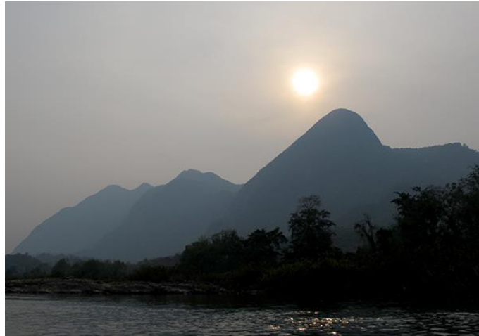
Mekong River Sunset, Nong Khiaw, Laos, Feb. 27, 2020