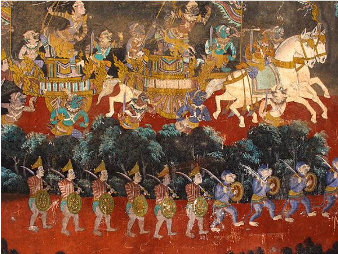
Gathering for War, Phnom Penh, Cambodia, February 2020