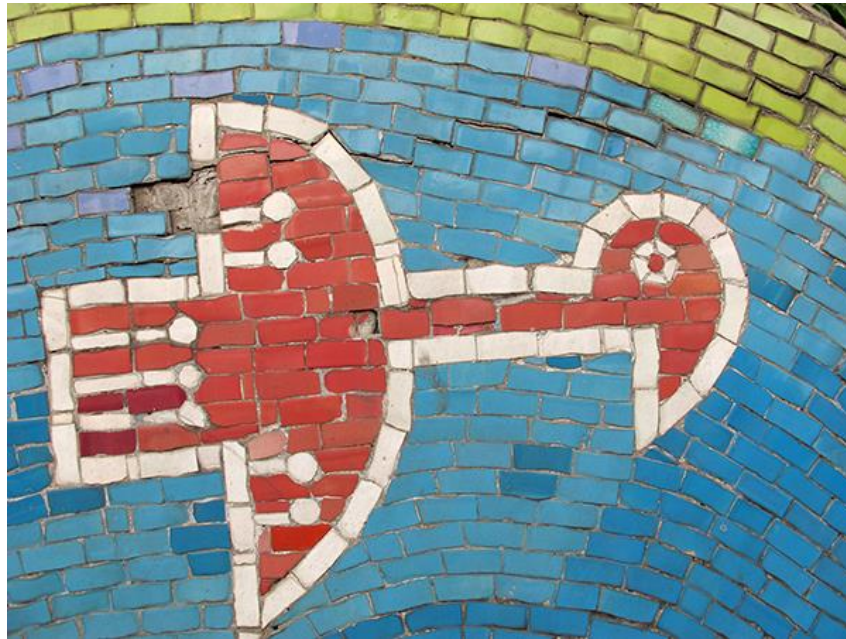
Mosaic Red Bird in Flight, Hanoi, January 2020

broken pieces, soaring memories and aspirations, all of a peace.