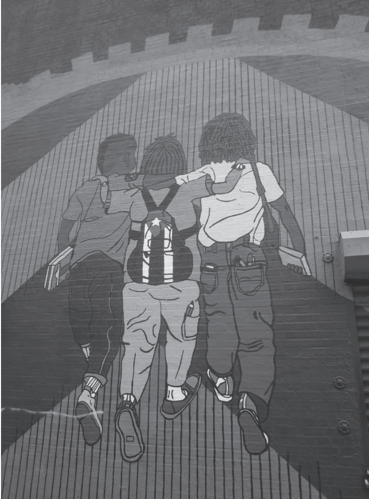
Figure 3 What We Want, What We Believe, 2009. © The New Museum's G:Class Program & Groundswell Community Mural Project