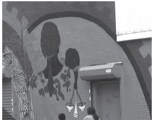
Figure 4 What We Want, What We Believe, 2009. © The New Museum's G:Class Program & Groundswell Community Mural Project