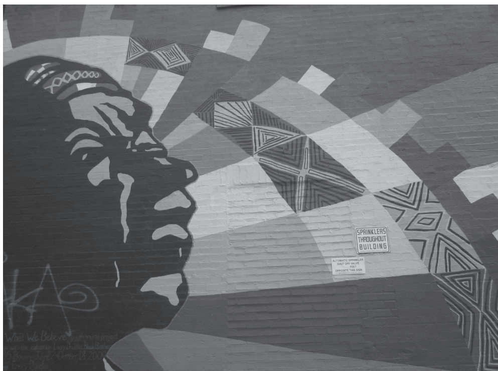
Figure 2 What We Want, What We Believe , 2009. © The New Museum's G:Class Program & Groundswell Community Mural Project