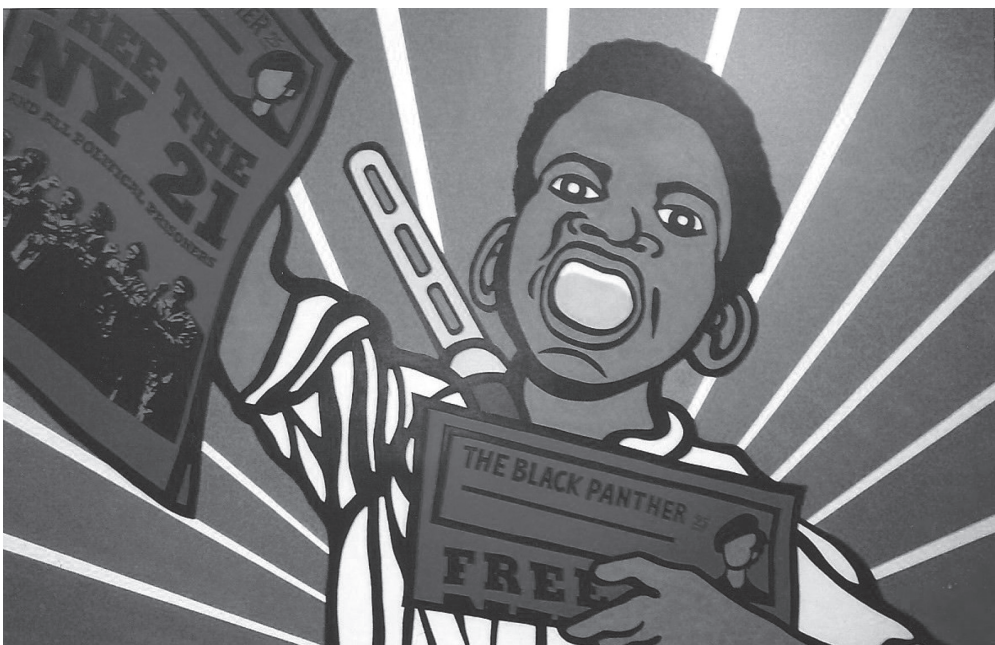
Figure 6 Emory Douglas, Free The NY 21. © 2014 Emory Douglas / Artists Rights Society (ARS), New York