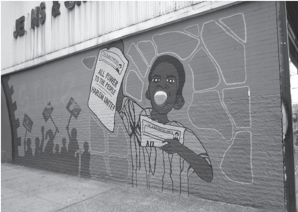
Figure 5 What We Want, What We Believe, 2009.