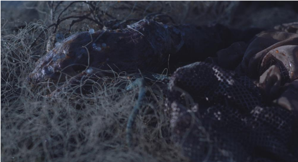
Figure 1: The creature (courtesy of Lillah Halla)

A creature washes ashore in a Brazilian fishing town. It is tangled in a fishing net; we can only make out its skin, burned by the salt of the ocean, cracked and leathery, adorned with iridescent pearls (Figure 1). A crackling sound, like a muffled dolphin's call, intertwines with the hissing of the sea and its waves, while the camera moves capriciously between the creature's indiscernible body and the faces of eager fishermen that try to untangle it.