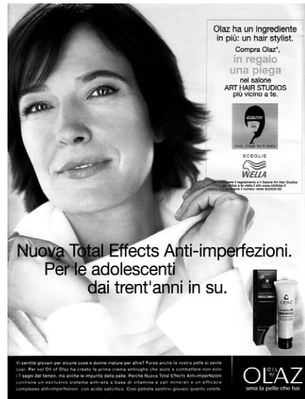
Fig. 2. Italian advertisement for Oil of Olay Total Effects Anti-Blemish Moisturizer ( Silhouette Donna , December 2005, p. 14)