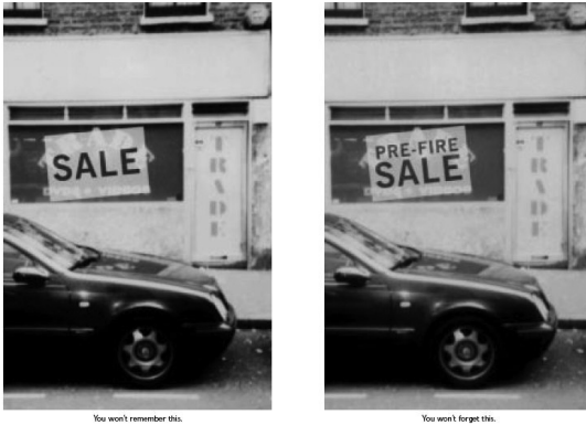
Fig. 8. Arden, Paul. 2003. It's Not How Good You Are, It's How Good You Want to Be . London/NY: Phaidon. Pp. 60-61. The captions read: "You won't remember this" and "You won't forget this."