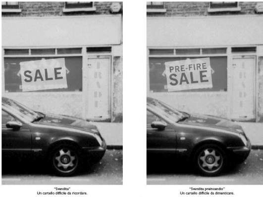
Fig. 9. Arden, Paul. 2005. Non conta volere, ma volere contare . Translated by Matteo Mazzacurati. London/NY: Phaidon. Pp. 60-61. The captions read: " 'Svendita' - Un cartello difficile da ricordare" and " 'Svendita preincendio' - Un cartello difficile da dimenticare"