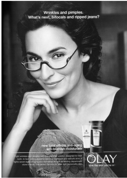
Fig. 3. American advertisement for Oil of Olay Total Effects Anti-Blemish Moisturizer ( Marie Claire US , December 2005, p. 33)