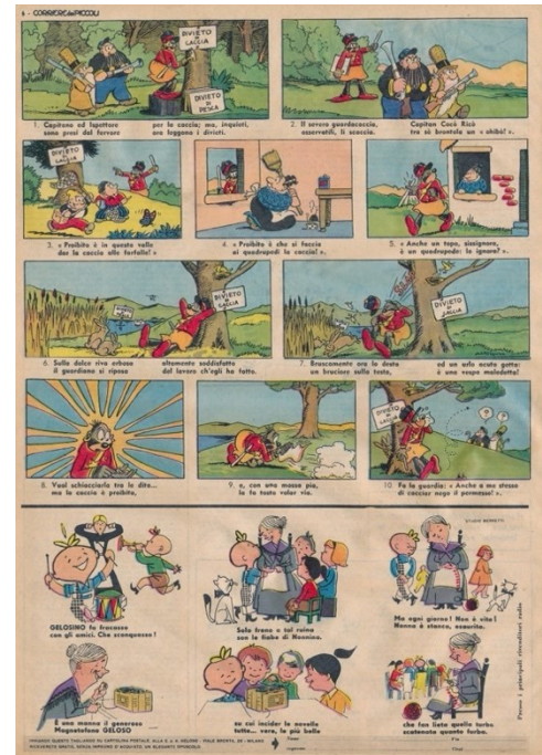
Figure 9. Corriere dei Piccoli 52, 1958, p. 6

Sometimes the text alters the original meaning, gives it another bias, or stresses specific meanings. The clearest instance is the Inspector acquiring a book on children's educational models ( CdP 1948-13), which seems to fit perfectly with the model and the editorial premises of CdP . In addition to mixing different publication periods, the less complex and mostly gag-centred pages are often chosen, and the "malice" that the Spanish edition transcribes in Pinocho magazine (Figure 8) seems absent from the Italian edition ( CdP 1958-52). 44