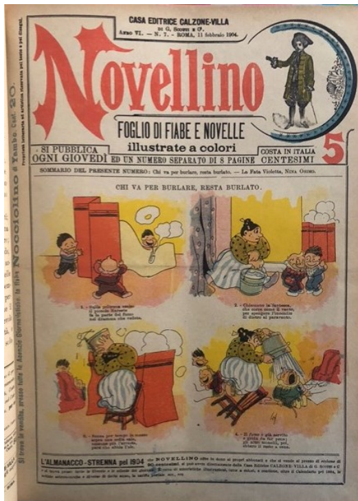
Figure 4. “Chi va per burlare, resta burlato” [Who Mocks, ends up being mocked], Novellino 7, February 11, 1904, cover (Personal collection Fabio Gadducci).

Balloons were changed to rhymed verses in Il Novellino (1898 –1927) which published an adapted version of Yellow Kid ( Bebè , 1901), and domesticated The Katzenjammer Kids and Foxy Grandpa with rhymed text. 37 Novellino 's emphasis on illustration and rhymed captions would inspire Corriere dei Piccoli . 38