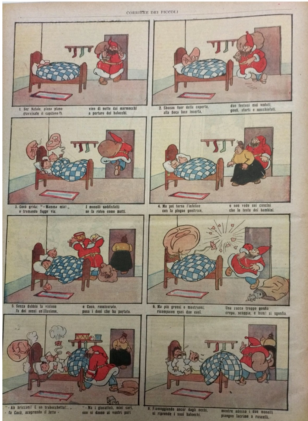
Figure 12. The Katzenjammer Kids, Corriere dei Piccoli 52, December 26, 1915, p. 6

In the same year of this Eutrofina advertisement, in the last episode of the Katzenjammer (26 December 1915), the Katzenjammer Kids put up their socks for Santa Claus.