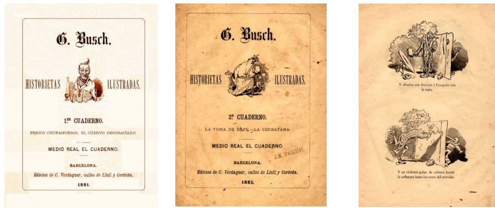
Figure 3. Historietas ilustradas . Guillermo Busch, Barcelona: C. Verdaguer, 1881 (Tebeosfera. https://www.tebeosfera.com/coleccion/historietas_ilustradas_1881_verdaguer.html )

If we compare the Italian version to the German original, the latter has hardly been touched. 14 The adaptation involves only a translation of the rhyming couplets, which in Italian are numbered to ensure proper reading order. In the same year (1881), various proto-comics by Busch appeared in Spanish publications—again not in general newspapers or Bilderbogen , but in a magazine specifically dedicated to children, Historietas ilustradas (1881), whose seven issues were entirely devoted to Busch. The pages of Max und Moritz collected in this publication show an aesthetic proximity with some works that Catalan and Spanish readers were used to, such as Apel·les Mestres' Granissada (1880). That allowed a continuous monographic publication in 7 issues, evidences an artistic dialogue in this genre throughout Europe, and underlines the influences of the German artist on the dynamic conditions of visual gags. 15