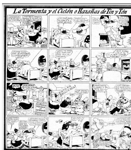
Figure 6. La tormenta y el ciclón o Hazañas de Tin y Tón , Pinocho , 1930s (Asanti, “El capitán Tiburón y sus sobrinos 02 - Rudolph Dirks,” issuu.com , https://issuu.com/asanti/docs/the_katzenjammer_kids_02 ).

Copyright acknowledgements such as the ones above or in some of CdP 's publications reflect an investment of a big budget in publishing comics relying on the vanguard printing technique. For example, Corriere della Sera (the Milanese newspaper publishing the children's periodical CdP ) bought Hoe rotational machines to print in colours on the covers, centre pages, and back covers from the first issue of CdP without limitations to copies. 39 Peruch and Santin further inform that the Milanese newspaper spent 93,000 lire on the first issue of the supplement, dated December 1908, of which 15,119 lire were reserved for the drawings and images. But not all adaptations of Buster Brown ,