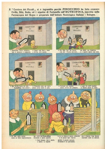
Figure 11. Nasica, Corriere dei Piccoli 14, April 4, 1915, p. 12

Children reading the magazine would have recognized these characters. Panels such as these loyalize and seduce the reader of Corriere dei Piccoli , and are also turned to advertising, as when promoting a typical 'health commodity' of the time through a narrative featuring a group of CdP stars. The characters must leave their small domestic home (not coincidentally "Corriere dei Piccoli") because, thanks to drinking Eutrofina, they grow so much that they have to build a larger home. This sequence reminisces the fairy tale of The Three Little Pigs . It shows the benefits of Eutrofina, appeasing even the most incorrigible boys while also literally imagining the place CdP 's characters took in children's imagination.