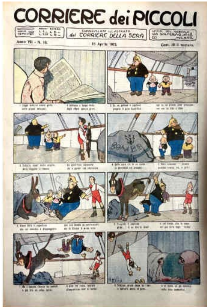
Figure 7. Attilio Mussino, Schizzo , Corriere dei Piccoli 16, April 18, 1915, p. 1.

Piccoli was bringing child readers right into the complexities of warmongering and changing alliances.