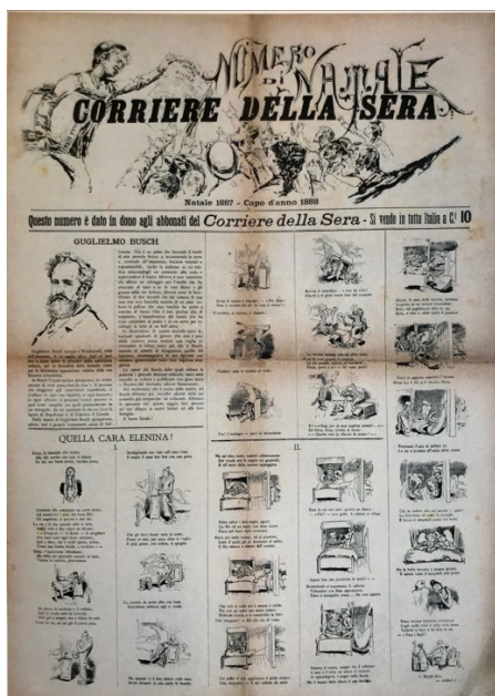
Figure 1. Corriere della Sera , Christmas Issue 1887, p. 1 (Giovanna Ginex, Corriere dei Piccoli: storie, fumetto e illustrazione per ragazzi [Milano: Skira, 2009], 16).

While Corriere della Sera did not have a children's supplement yet (it would only do so from 27 December 1908), other nineteenth-century children's periodicals would use Busch's proto-comics, both in Italy and Spain. As Fabio Gadducci has shown, on 8 December 1881 Giornale per i bambini , one of the earliest children's Italian periodicals, published Wilhelm Busch's work by featuring the story of Die Fliege [ The Fly ] on its cover (Figure 2). 13