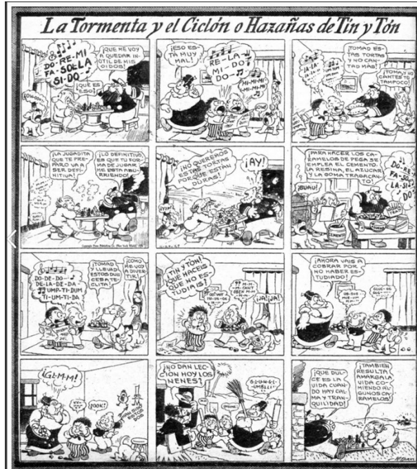
Figure 8. La tormenta y el ciclón o Hazañas de Tin y Tón, Pinocho , 1930's (Asanti, "El capitán Tiburón y sus sobrinos 02 - Rudolph Dirks," issuu.com , https://issuu.com/asanti/docs/the_katzenjammer_kids_02 ).