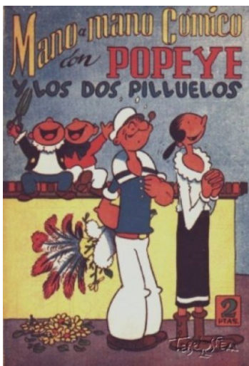
Figure 10. “Los dos pilluelos,” Popeye 1, 1948, cover.

Considering the set of phenomena of variation, domestication, glocalization, and the cultural and historical implications that they embody, it is also possible to argue that the circulation of The Katzenjammer Kids was particularly rich in phenomena of cultural re-appropriation. From an iconographic point of view, it generated subtle variations, collages, and even foreshadowed contemporary musical and cinema mash-ups and the potentiality of cross-overs in the specific field of superhero comics. The Katzenjammer Kids were not merely transposed for children's entertainment. Many children's weeklies understood that recurring characters, through their carefully timed appearance in the magazine, could create a relation between the child, the periodical, and consumption. One could think of this connection as a parasocial relationship, as the “‘contract’ that Martin Barker has written about was solidified.” 47 The comics characters ensured the comics magazines would be bought. Many covers thus bring together a multitude of characters to announce which characters/series to expect and search for within the ephemeral's pages. Thus, for example, Popeye was staged with The Katzenjammer Kids in Pim Pam Pum in the 1950s.