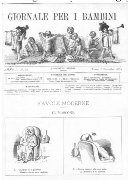
Figure 2. Giornale per i Bambini 23, December 8, 1881 (Fabio Gadducci, Notes on the Early Decades of Italian Comic Art [San Giuliano Terme: Felici Editore, 2006], 14).

While Corriere della Sera did not have a children's supplement yet (it would only do so from 27 December 1908), other nineteenth-century children's periodicals would use Busch's proto-comics, both in Italy and Spain. As Fabio Gadducci has shown, on 8 December 1881 Giornale per i bambini , one of the earliest children's Italian periodicals, published Wilhelm Busch's work by featuring the story of Die Fliege [ The Fly ] on its cover (Figure 2). 13