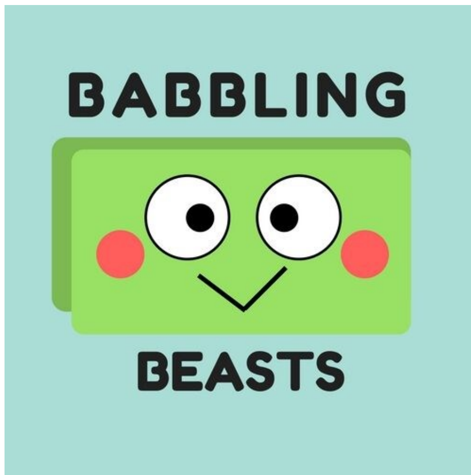
Figure 1. Project Logo and Badge for Babbling Beasts.

Enfants lecteurs, XXI e siècle, méthodes de recherche basées sur l'art, multimodalité, lecture de détente