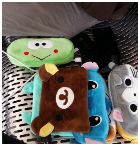
Figure 5. The Beasts aka furry pencil cases (in a dormant state!).

Aliens, monsters, and spaceships were part of three Beast stories, again indicating the children’s interest in other universes and alternate realities commonly found in various media forms of fantasy and science fiction. The influence of games like Fortnite and animation featuring “Battle Royale” scenarios emerged in the propensity of the Beast team threesomes to craft scenes where their Beast had to slay an opponent or shoot their way out of an ambush. A couple of teams introduced violent murders early on in their stories, suggesting a love for dramatic plot twists and a knowledge of sudden death that is common to television melodrama, crime dramas, and thrillers, but is also sometimes a component of fantasy and science fiction across media and platforms. Team “Quacker the Duck,” for example, pitched a drive-by gang-style shooting as their starting point, until we persuaded them that extinguishing your main character at the beginning of the story-game was somewhat counterproductive!