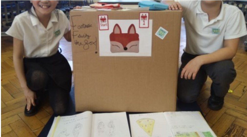
Figure 2. Team Felicity the Fox display their “station” in preparation for the Celebration Event.

objects or dotted around a space or throughout a series of rooms. Simple objects like cardboard boxes can also serve as “stations” for the Babbling Beasts story-games—as they did during a Celebration event for families held at the end of our workshop series in April 2018.