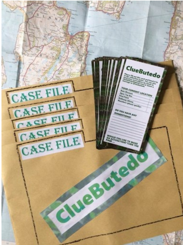
Figure 12: ClueButedo forms and Bute map.

The two-sided form we created, dubbed “ClueButedo” (a portmanteau of Cluedo and Bute), began with information about how to return the form, including a Gmail address and a Twitter handle (both of which would be quite difficult ways to return a paper form). The form asked the respondent to tick their location, with boxes indicating various festival sites: Bute Museum, the open top bus, Print Point (the bookshop), Rothesay Library, or elsewhere. Next, it asked, “Do you have any suggestions?”, with several lines of space for free-text answers. The jump to this open question, without asking for any further information other than current location (that is, missing out typical demographic information) was intentionally done to disrupt the standard questionnaire pattern. The respondent was then prompted to go overleaf with the text, “Would you like to make an accusation? Turn the page...” (An “accusation” in Cluedo terms is used when one of the players suspects they have sufficient evidence to state the details of the murder.) On turning the page, respondents were then asked to tick boxes of “Whodunnit?” (with choices of names of authors appearing at the festival), “With what weapon?” (featuring items from the Bute Museum used in its Facebook promotion of the festival), and “Where was the murder