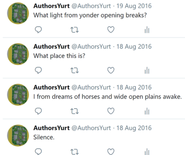
Figure 2: @AuthorsYurt awakes.

And thus the satirical Twitter account @AuthorsYurt began: with silence, then a distinctive turn of phrase, and a not-so-subtle nod to Shakespeare (read the screenshot in Figure 2 from the bottom to re-create chronological order):