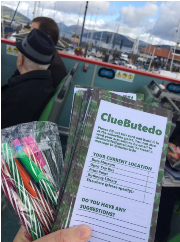
Figure 14: ClueButeDo forms and stripy pens on the open top bus tour.

members' anxiety, though others were still discombobulated. Some festival attendees asked questions about the form, including whether it was designed to elicit a particular kind of feedback, and whether it would be compared to other datasets, including to see whether more people reply than normal. 62 These were all very sensible questions, but at odds with our actual research aim, which was to play creatively with ideas of feedback and participation.