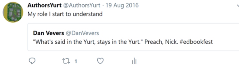
Figure 3: @AuthorsYurt achieves consciousness of its role.

@AuthorsYurt also retweeted the sharp observation in Figure 4 about the overuse of the word “yurt” at the festival, to emphasize both the Yurt’s cultural and physical (dis)location, and the satirical intent of the account: 37