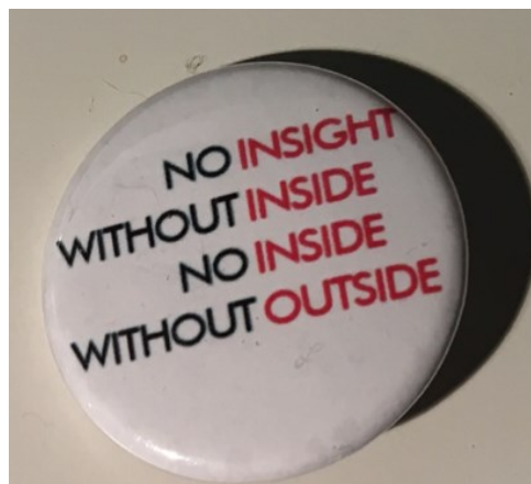
Figure 1: Nunu Otot button badge.

NO INSIGHT WITHOUT INSIDE NO INSIDE WITHOUT OUTSIDE