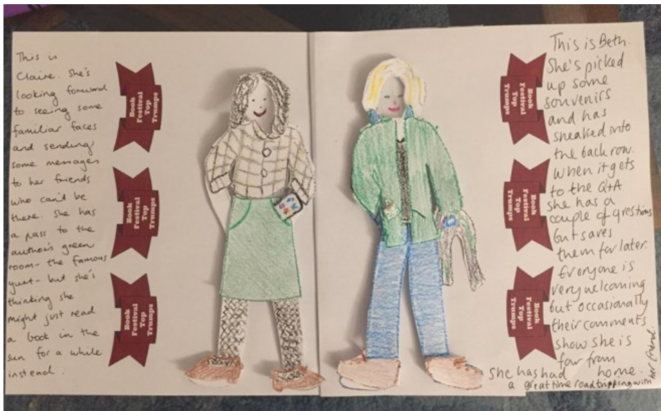
Figure 11: Paper dolls: Claire and Beth.

At a certain point in the creation of these six characters, one of us became uncomfortable with the objectification and simplification that our paper doll experiment involved, and demanded that we make paper dolls of ourselves as well. We made dolls of each other (Figure 11), a process which required a lot of trust (“Don’t make me look hideous!”) and pre-emptive forgiveness (“I’m sorry I’m so bad at drawing!”).