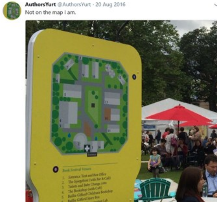
Figure 5: @AuthorsYurt notes it is not on the map.

Some authors enthusiastically embraced the possibility of having an online conversation with @AuthorsYurt, taking advantage of Twitter’s interactivity. A.L. Kennedy, whose observations in On Writing we referred to earlier, seemed particularly taken with @AuthorsYurt, comparing its turns-of-phrase to Yoda’s, and sending a series of cheeky tweets. Adding to the humour, a second Authors Yurt account was set up (by person or persons unknown to us), then a third joined the fray, flirting with horse gifs and the lure of the Mongolian plains. The original @AuthorsYurt took the opportunity to satirize the quantification tendency of creative industries discourse, by counting the number of Authors’ Yurt accounts. In response to a journalist’s tweet that reported festival “ticket sales up 3.5% and more than 62,000 books sold this year,” @AuthorsYurt tweeted, “Also, talking yurts 3 from 0 up.” 42