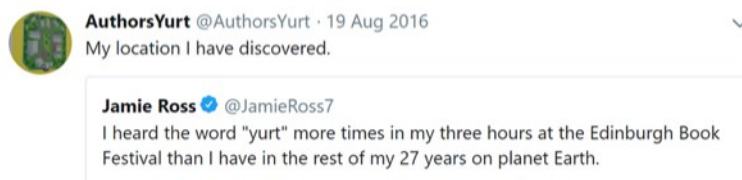
Figure 4: @AuthorsYurt discovers its location.

@AuthorsYurt also retweeted the sharp observation in Figure 4 about the overuse of the word “yurt” at the festival, to emphasize both the Yurt’s cultural and physical (dis)location, and the satirical intent of the account: 37