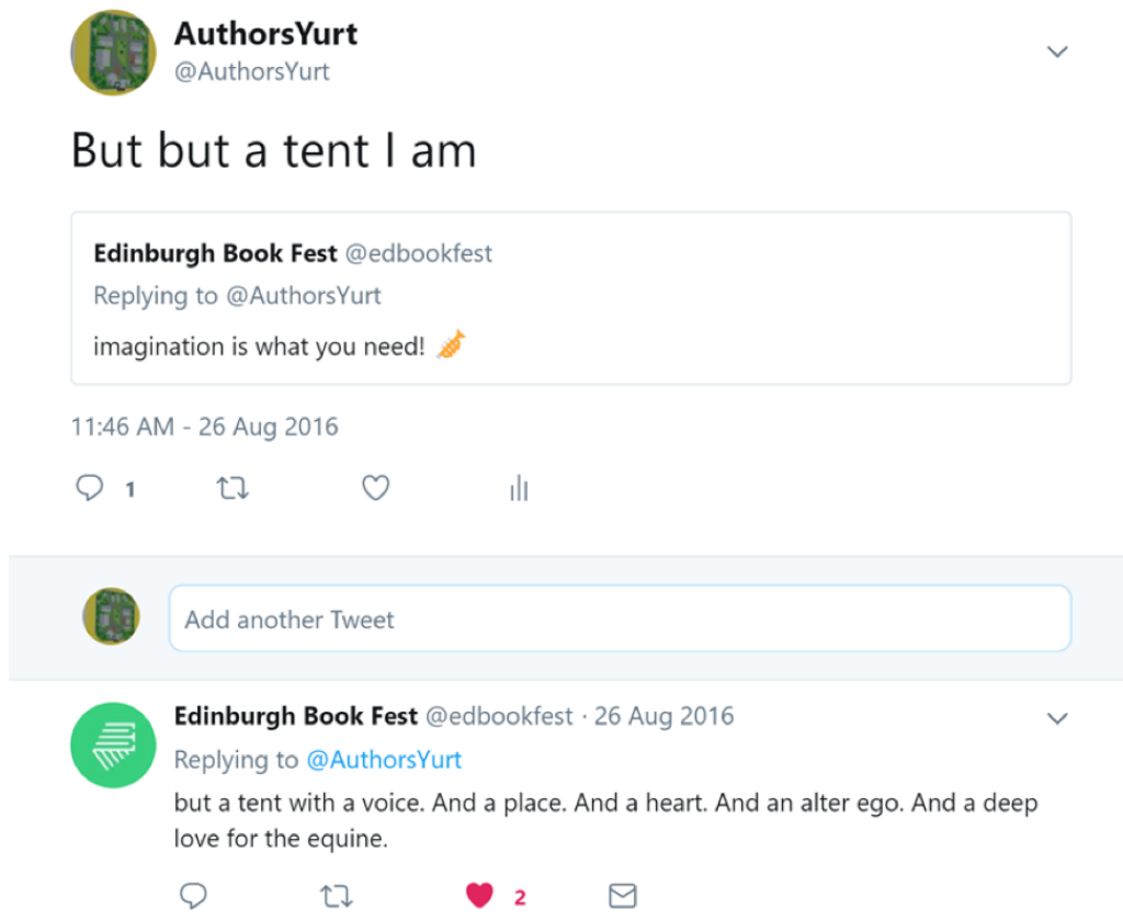
Figure 6: @AuthorsYurt’s exchanges with the official Edinburgh International Book Festival Twitter account.

There were exceptions to this warm reaction, however. The Festival Director seemed less enamoured. When @AuthorsYurt sent a tweet that read “Confused, I am,” the Director responded by quoting it with the single-word commentary, “Limpid”, a response ironically lacking in clarity. @AuthorsYurt replied deferentially: “I understand. The drawstrings are tightly sealed.” 44 When the festival eventually ended, @AuthorsYurt signed off—but not without the Festival Director declaring his wish to put @AuthorsYurt and @authorsyurtie (the more active of the additional accounts) back in a box (Figure 7).