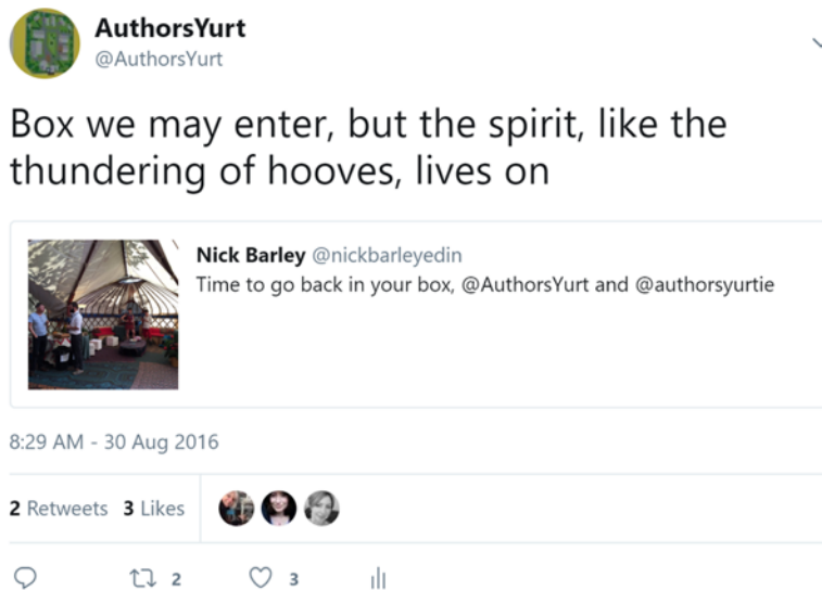
Figure 7: @AuthorsYurt goes back in the box.