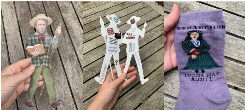
Figure 8: Literary tourism: Transcendentalist paper doll cards and socks.

In the era of late capitalism, cultural tourism, Etsy, and quirky merchandising, it is not very surprising to come across dolls made to resemble literary figures. Fans of writers can buy such products as an expression of their enthusiasm, just as they may buy other literary merchandise, or undertake pilgrimages to literary sites and writers’ houses. 46 On a tour of Massachusetts writers’ houses in 2019, for example, we bought paper doll cards of Ralph Waldo Emerson and Henry David Thoreau, adorning them with quotable stickers. We also bought socks that feature a doll-like image of Louisa May Alcott under the slogan “We March On” (see Figure 8).