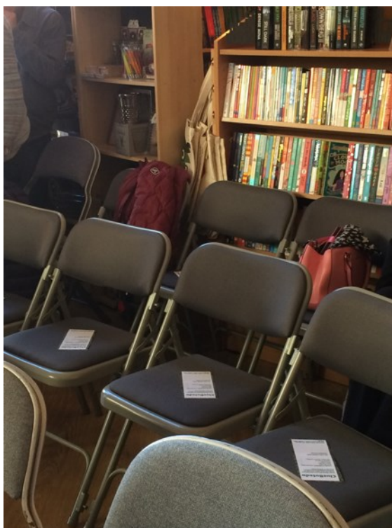
Figure 13: ClueButeDo forms on bookshop chairs.

Claire then set off on bike, train, and ferry to Bute with copies of the blank forms and a map in her cycle panniers (Figure 12). On arrival, she purchased some 20 stripy pens for £1 from a seafront shop (pleasingly, these looked like thin versions of rock, a typical British seaside sweet). Meanwhile, Beth had set up the project’s Twitter account (@ClueButeDo), and began to tweet, responding to authors arriving on the island and audience members excited about meeting them, and using alliterative phrases to establish the account’s voice and perspective on mysterious matters.