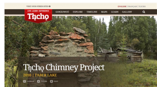
Figure 1 Tłicho Chimney Project webpage. The webpage provides background on the stone chimneys as well as video documentation and a link to the “Tłicho Chimney Project” report (Clarskon 2010). Tłicho Chimney Project | Tłicho History (https://tlichohistory.ca/en/stories/tlichochimney-project)

Indigenous people in the north. The Indigenous houses and fireplaces are an example of cultural diffusion, the process by which ideas are spread between cultures and, in some instances, they might have also been expressions of social status. In most cases, other than memories, all that is left today of these houses is a mounded outline representing the footprint of the structure and a pile of rubble that are the remains of the fireplace. Using primary and secondary sources of information this article will explore the cultural heritage of the stone fireplaces of Denendeh.