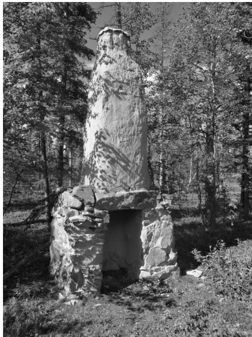
Figure 8 Remains of one of four chimneys at Fort Reliance in 2021. P. Carroll.