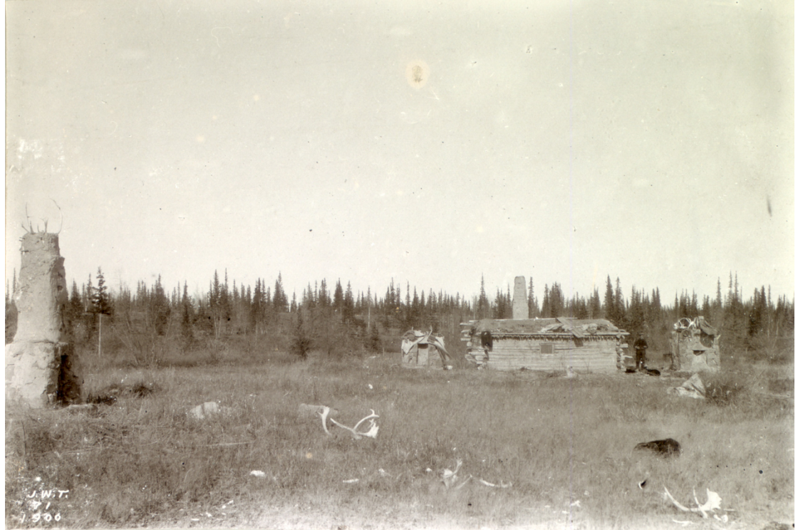
Figure 7 Chimneys at Fort Reliance in 1900.