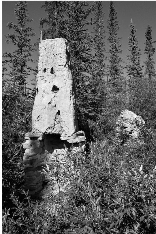
Figure 4 Remains of Fort Confidence chimneys in 2011. A. Bunker, “Bunk’s Outdoor Angle,” Aug. 16, 2011. https://bunksoutdoorangle.com/awarded-the-arctic/