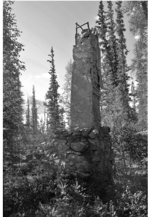
Figure 6 Remains of one of four chimneys at Fort Reliance in 2021. Notice the wooden lattice framing the chimney. P. Carroll.