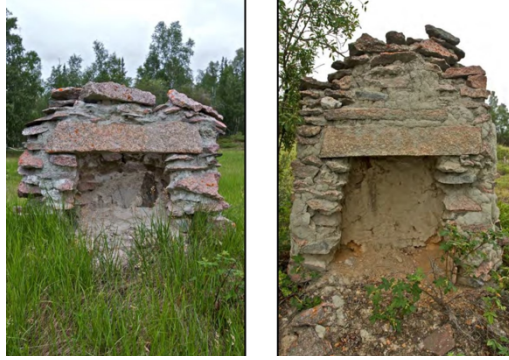
Figure 3 Remains of two stone fireplaces at Faber Lake in 2010. Tlichō Chimney Project | Tlichō History ( https://tlichohistory.ca/en/stories/tlichochimney-project )