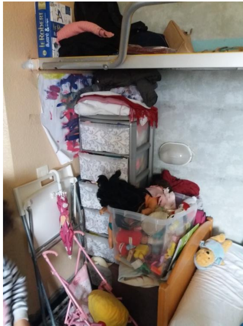
Figure 2 Boxes in Nadia's room, 2020, L. Overney.

The bunk bed, still too high up for the little girl, is used for storage (a duvet, blankets, an iron, a roll of paper towel, some carefully folded clothes, drawing materials). Underneath, plastic boxes are stacked up that contain the child's clothes and, next to them, a suitcase with clothes for Nadia. Next to the clothes boxes are two other boxes for toys (figure 2). The couple also has a small table (70 x 70 cm) covered in shiny cloth. Underneath it are the husband's clothes stored in a travel bag and their rolled-up prayer rug. Nadia also has a small table with two folding plastic chairs, bought at the discount supermarket opposite the hotel. The room has a booth, a sort of prefabricated polyester shell measuring 1.5 metres by 1.5 metres, with a shower and sink, where dishes can be done. vii