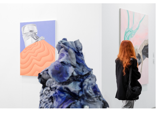
Figure 3 Artissima 2022, Photo credit: Perottino - Piva - Peirone / Artissima

view the artworks with the relative comments, I recommend taking a virtual tour at <u>https://www.artissima.art</u>.