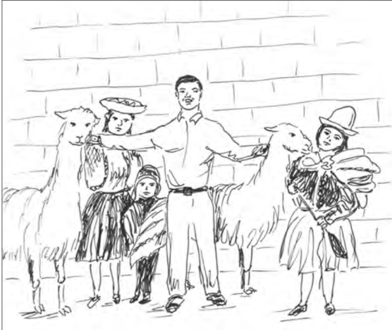
Fig. 4 Tourist posing with local women, child, and llamas, based on “Making friends with locals” (TripWow-globetrekker 2014).