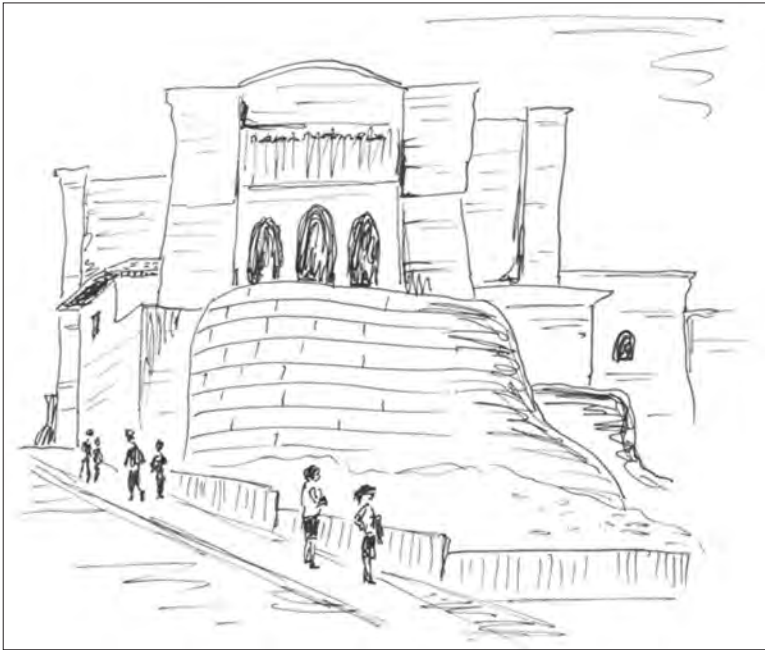
Fig. 1 (above) Illustration of typical photo composition, with architectural focus, based on “Santo Domingo Church with big Inca wall” (TripWow-Travelpod 2014).