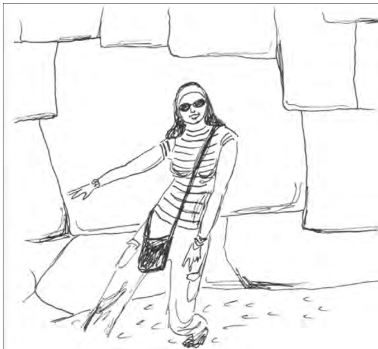
Fig. 2 (below) Tourist posing in front of famous Inca wall, based on “Cynthia giving us the history speel...hee” (TripWow-themurphys 2014).

mirroring nature but as a specific “way of seeing” that is shaped by, and in turn perpetuates, existing social ideologies and discourses (Berger 1972: 10). Through its focus on social factors, semiotic analysis also emphasizes continuities between analogue and digital photography (Larsen 2008: 144). Last, a critical view leads us to a consideration of power structures, and of whose interests are reflected, perpetuated, or challenged through specific depictions (Albers and James 1988: 150; Caton and Almeida Santos 2008). With any approach to analyzing images it is important to remember that meanings are not fixed and that multiple understandings are always possible (Albers and James 1988: 142; Sontag 1977).