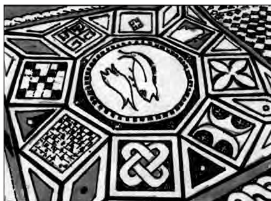
Fig. 1 Megiddo floor mosaic: archeological sketch of an early Christian floor mosaic with a motif of a pair of fish surrounded by a geometric pattern. Megiddo, Israel. 3rd century.

In terms of the Christian architectural record, it cannot be avoided that the earliest clearly cultic space discovered to date, the Megiddo church, is a large 54-square-metre formalized space dating well before Constantine, to ca. 230 CE. Like other cultic spaces of the time it contains an elaborate mosaic floor, including the early and iconic symbol of the fish (Fig. 1). Most tellingly of Christian attitudes of the time, are the three inscriptions on the floor. All three are typical of Roman ex voto offerings found in temples, imperial basilicas, and funerary spaces asking that the reader remember the donor in prayer. The most significant of the inscriptions is for a table (τράπεζα) at which the Christians celebrated the Eucharist. Whether it was a wooden/portable or stone/fixed altar is