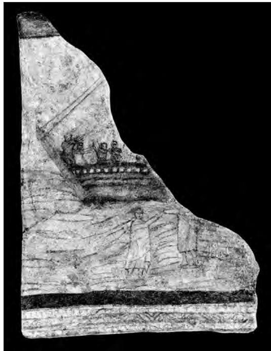
Fig. 8 Dura-Europas: Wall fresco fragment, ca. 232, depicting Christ (partial) walking on water and taking Peter's hand. From the baptistery of the house-church at Dura-Europas, Syria.

Execution of the baptistery images at Dura-Europas indicates the community’s intention to create an effecting reality that involved the space and those who took part in ritual events. Viewing the baptistery images was not meant simply as a form of pedagogy representing Christian beliefs regarding baptism. Nor were the images simply signs or material representations of a dematerialized spiritual world. Rather, the image was intended to allow the viewer to partake in the induction of a number of effecting presences: The Good Shepherd, Adam and Eve, the Annunciation at the well, David and Goliath, the Healing of the Paralytic, Peter and Jesus walking on water, and the Bridesmaids of Matthew 25 (Serra 2006: 77-78). Consequently, the art was not intended to decorate but marked