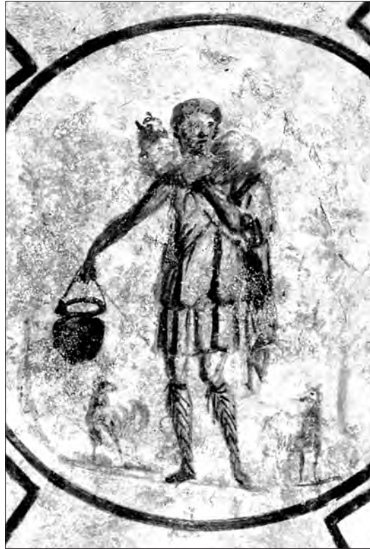
Fig. 6 Good Shepherd of Callixtus: Catacomb of Callixtus, Rome. Ceiling fresco of a Good Shepherd in a bucolic scene, he is carrying a sheep on his shoulders and there are two others at his feet. Mid-3rd century.

This burgeoning material culture of small cult items, exemplified, for example, in the Leuven Database of Ancient Books that shows the 2nd and 3rd century as producing by far the most copies of scriptural texts (Hurtado 2006: 45), finds correlation with White’s study of ante-Constantinian Christian architecture. The numerical increase of known cult objects in the historical record is paralleled by an increase in renovated properties solely serving Christian worship and the accrual of property for catacombs. This is the period of the renovated domus ecclesiae , as at Megiddo and Dura-Europas, and the somewhat later form of the aula ecclesiae (White 1990: 118ff). That a growing body of cult objects occurs in concert with a growing number of house-church