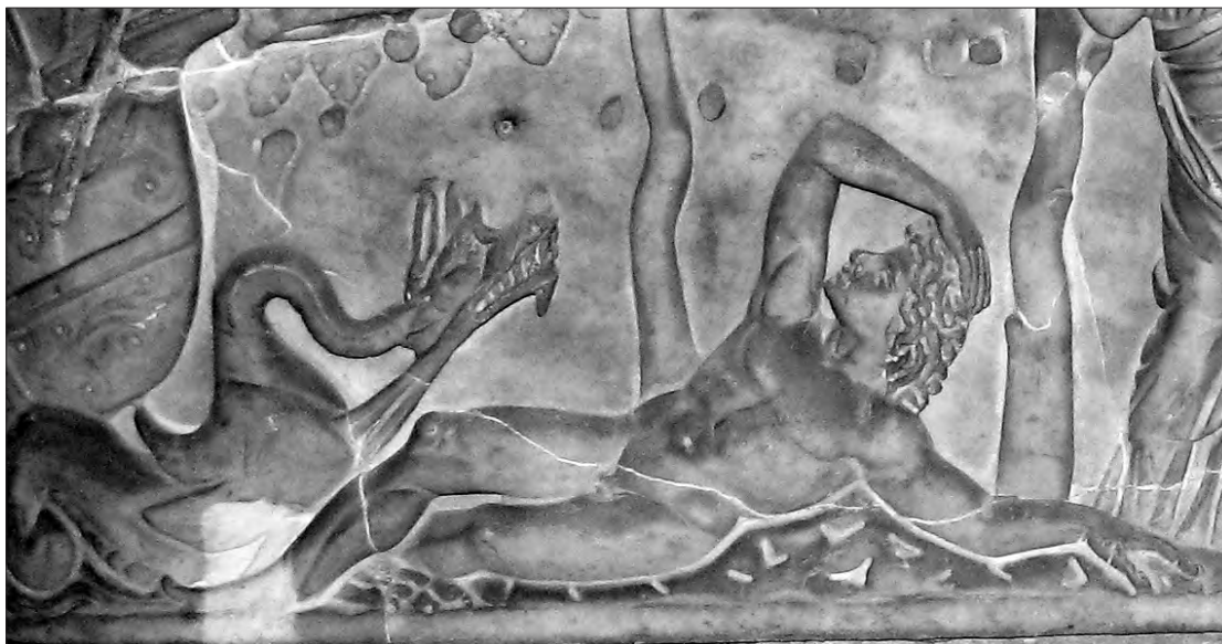
Fig. 10 Jonah: Jonah is represented sleeping under the ivy after being vomited from the great fish, shown on the left. The pose of the reclining Jonah with his arm over his head is based on the Greek mythological figure of Endymion. Detail. Third-century sarcophagus from the Church of Santa Maria Antiqua, Rome.