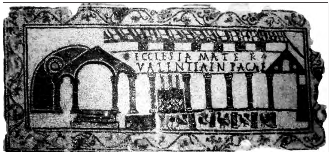
Fig. 9 Tabarka Mosaic: Mosaic panel with a schematic depiction of “Mother Church.” The earliest known representation of a Christian church in art. Roman North Africa. 4th century. Bardo Museum, Tunisia.