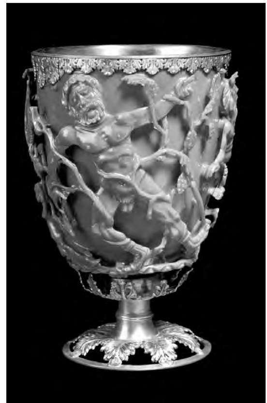
Fig. 7 Cup: The Lycurgus Cup . 4th century. Late Roman glass-cage cup made of a dichroic glass. Likely intended for use at Bacchic cult celebrations.

it can be said that catacomb art represented the belief in religious experience that was mediated by location as the space took on an eventfulness in the watching of symbols and biblical images. Thus a two-fold insight is derived from the Callixtus catacomb: the willingness of Christians to demark particular, significant locations and a correlating factor that, at the time, any architectural instantiation of religious place (such as catacombs and house-churches) was expansive and inclusive enough to include new loci within the religious experience. 10 Christian art seemingly played a significant role in stabilizing sacral perceptions in this expansion of Christian space. In the building of the Callixtus catacomb and the subsequent network of catacombs in Rome, the imaged space created a context in which the sacral nature of the space itself, the Christian dead, martyrs, biblical symbols of salvation, and the biblical promise of resurrection evoked a deeply felt character of the sacred (Bisconti 2013: 211-28). As to be expected, a primary image the viewer encountered in many of the hypogea was the image of Christ, either in the place of Hermes (the Good Shepherd), image of philanthropia (Fig. 7), or later, Christ