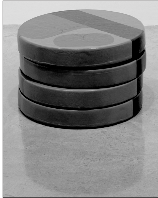
Fig. 3 (Left) Sonny Assu. Silenced #1. 2009. Acrylic on stacked elk hide drums. Four drums overall dimension 8" x 18" x 18."