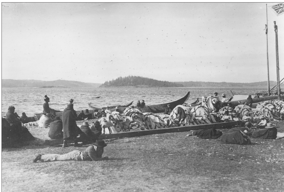
Fig. 6 "Potlatch at Fort Rupert. Piles of Hudson's Bay 'Point' blankets are being counted out for giving away. Haida canoes are drawn up on the beach." Ca. 1890.

culture and the repression of their rights to practise their culture. In the act of stacking drums, Assu makes an explicit reference to the stacks of blankets that were prepared prior to potlatch ceremonies: the blanket was considered an item of wealth and was distributed to guests during the ceremony. Assu is also referencing other visual representations of stacked blankets that emerged from the documentary work of photographers and anthropologists who conducted ethnographic fieldwork along the Pacific Northwest Coast. As seen in the archival image from the Hudson's Bay Company Archives (HBCA) (Fig. 6), one of many examples of such photographs, woollen blankets are seen piled high and deep for their eventual distribution at a potlatch ceremony in a Haida community. Therefore, Assu's "visual quotation" (to borrow a phrase from Patricia Vervoort) of stacked woollen blankets emerges from both ethnographic photographs and oral traditions that commemorate momentous ceremonies of this significant traditional practice not only in Assu's Kwakwaka'wakw community of the We Wai Kai First Nation (Cape Mudge), but along the Pacific Northwest Coast in many First Nations communities (Vervoort 2004: 469).