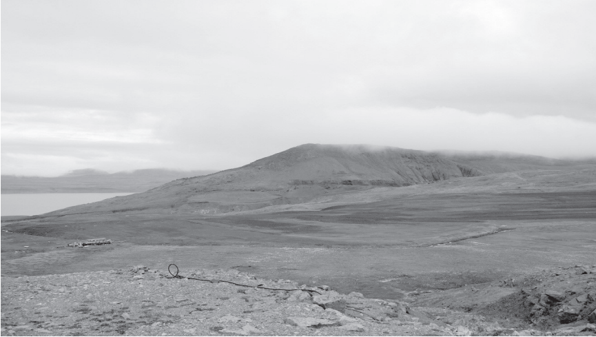
Figure 4. Nanisivik townsite, 2011.