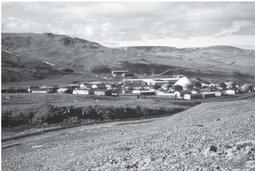
Figure 3. Nanisivik townsite, 1991.