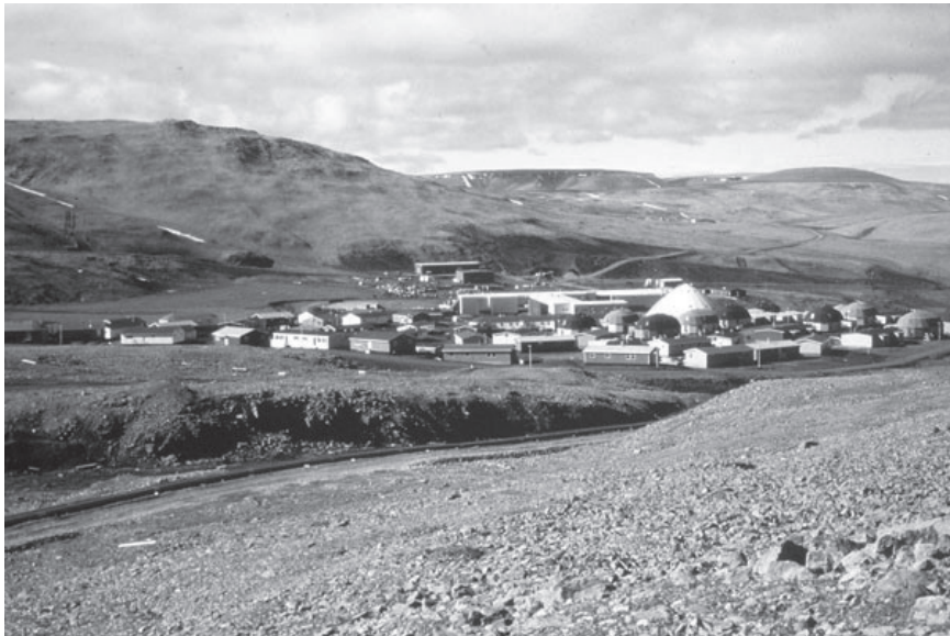
Figure 3. Nanisivik townsite, 1991.