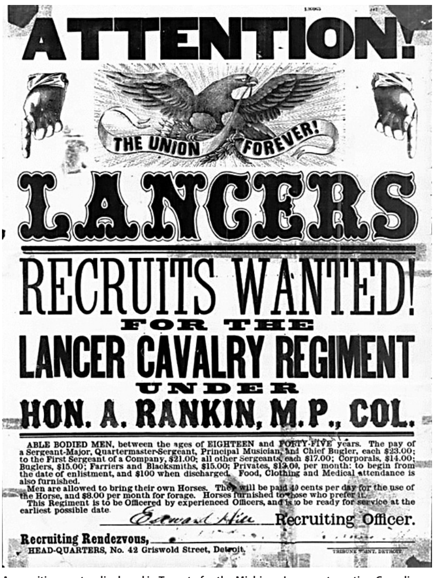
A recruiting poster displayed in Toronto for the Michigan Lancers, targeting Canadian volunteers to fight for the Union in the American Civil War. Canadians had a long history of serving in foreign militaries, a practice which many feared could drag Canada into wars in which they would otherwise be neutral.