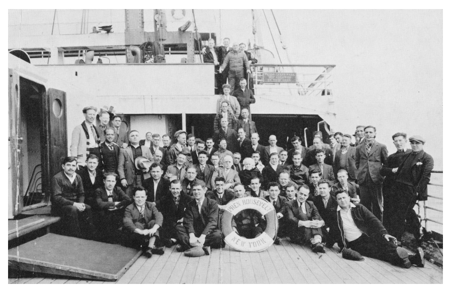
Canadian and American volunteers, although travelling in secret, gather for a group photo on the deck of The President Roosevelt during their transatlantic crossing in February 1937.