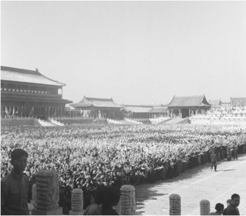
Peace Meeting, Square of the Temple of Heaven, Beijing, 13 October 1952.