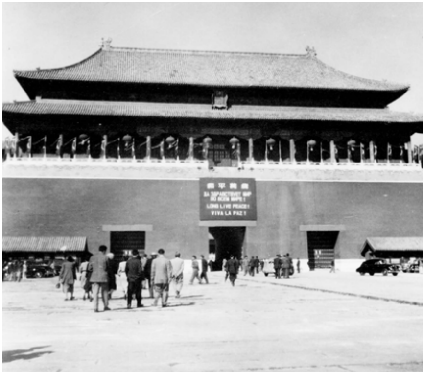
Asia-Pacific Peace Conference, Beijing, China, 2–12 October 1952.