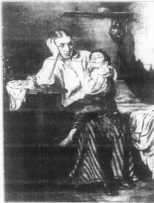
БЕЗ СРЕДСТВ ДО ЖИТТЯ.

ІЛЮСТРОВАННИЙ ЖУРНАЛ — ВИХОДИТЬ ДВА РАЗИ В МІСЯЦЬ