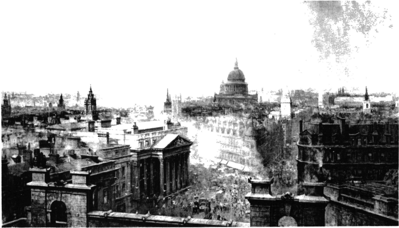
Figure 2. Niels Moeller Lund, The Heart of the Empire , 1904. Oil on canvas, 137.2 x 182.9 cm. London, Guildhall Art Gallery