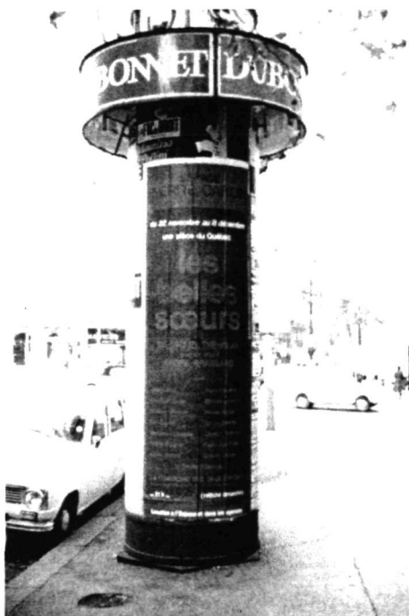
Publicity column in a street of Paris advertising Michel Tremblay's play.

Most Parisian critiques gave a more or less lengthy summary of the play, something many did not do in Québec. The reviews of the play itself went from one extreme to another. For some, the play was just about a bunch of women sticking grocery stamps in booklets while gossiping and insulting each other; 65 and for others, it was a social study of the popular classes in Montréal, and more specifically a study of the fate of women living in difficult conditions. 66 Still, for most, it was a political statement about Québec liberation and sovereignty, as Michel Tremblay stated in his Parisian interviews. Though most reviewers stressed the "local flavour" of the play, a few recognized its universal aspects, linking it to the conditions