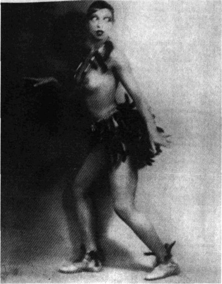
Figure 1a: Josephine Baker

later appeared in Vancouver in the 1950s. Cast in the show, “La Revue Negre” as a “tribal, uncivilized savage” from a prehistoric era, hence consigned to “anachronistic space,” Baker was rendered intelligible and digestible to white Parisian voyeurs. 84 Narrating the fantasy of the jungle bunny — the oversexed object of both white European fascination and repulsion — she danced in banana skirt and