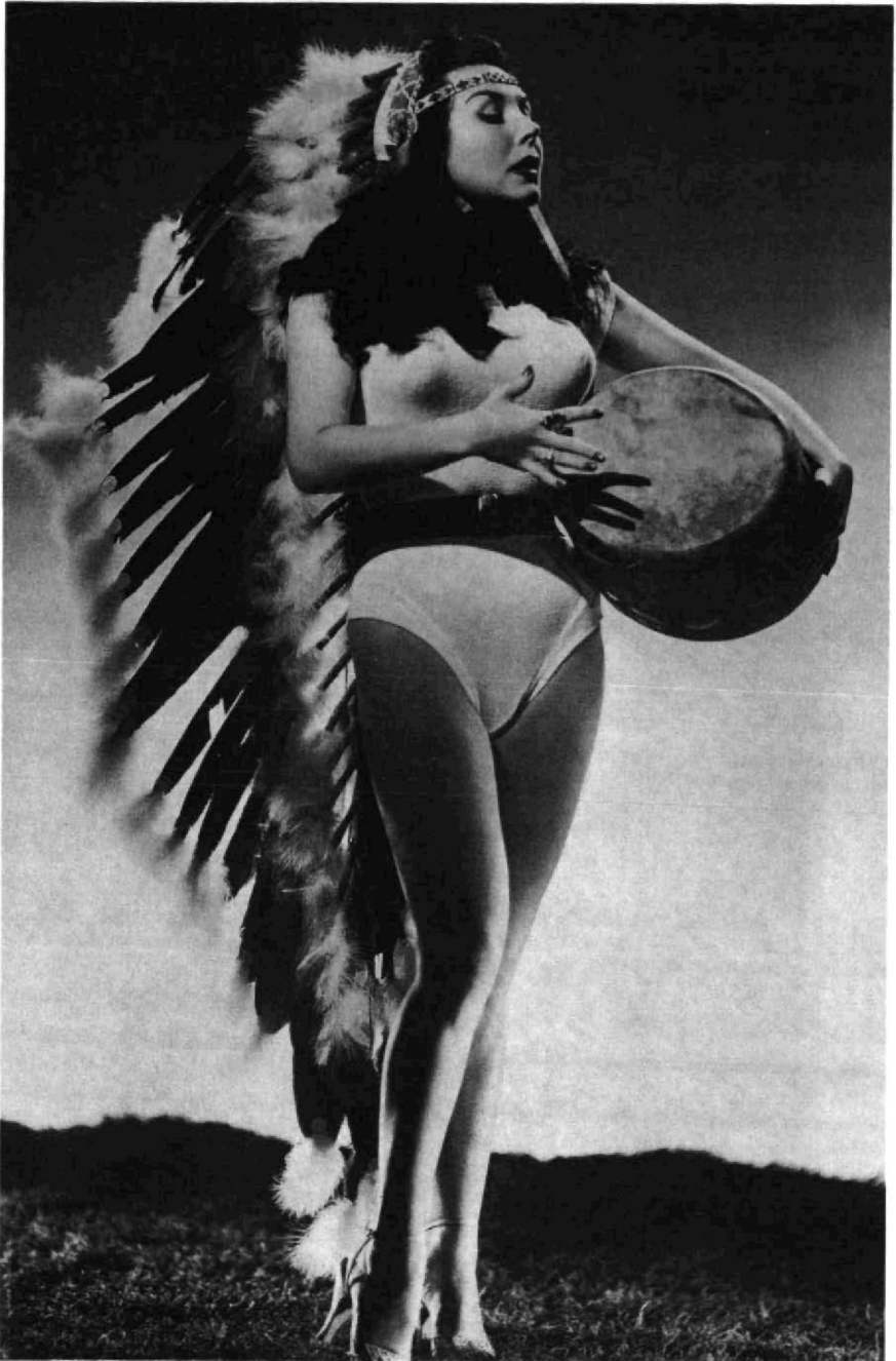
Figure 2: Princess Do May