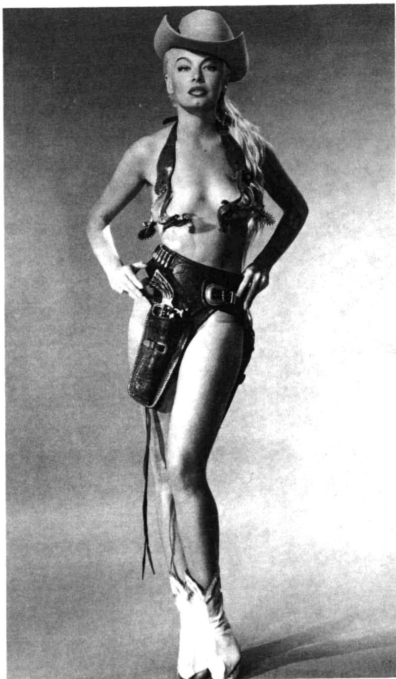
Figure 3: Lili St. Cyr