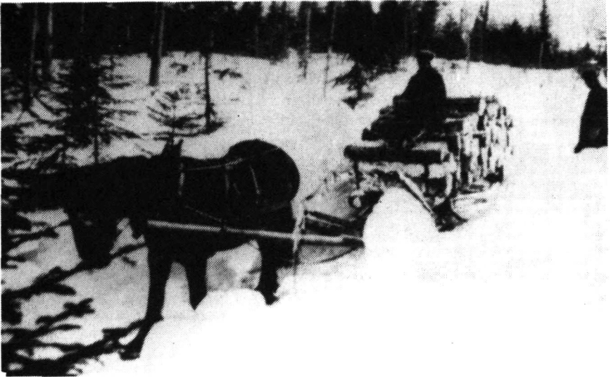
Hauling with a single team.

The...concession was arranged in order to help out lumbermen who will remain in the camps one month, and avoid their having to look for passes through the Relieving Officers and others if they are fortunate enough just to break square. It might help to make the men more contented and will keep them off the dole at any rate for a month if they will remain. 33