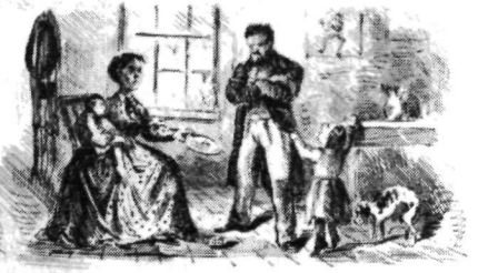
5. THE POOR CABMAN'S HOME.