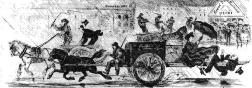
1. ON THE ARRIVAL OF TRAINS.