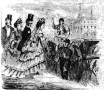
2. A WEDDING PARTY.