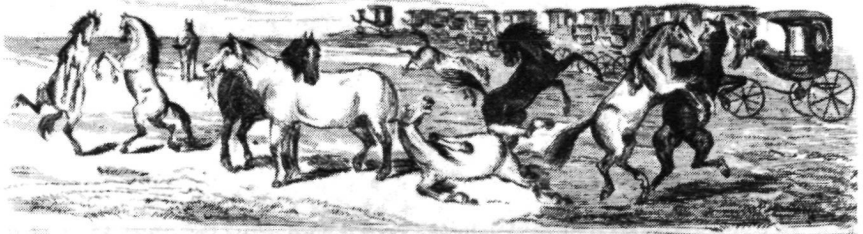
6. A RECEIPT FOR THREE.