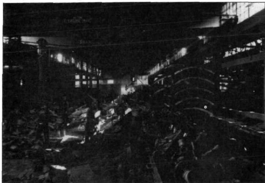
Conditions in the foundry in the 1920s and 1930s were primitive and dangerous.

The sand blast was where they put the casting in after they came out of the mould box. A guy stands in there and he looks like a diver. It's a job you wouldn't believe. He gets closed in a steel box and the casting is rolled in on a flat car and he's got this hose . . . and he just belts that thing at the casting. 27