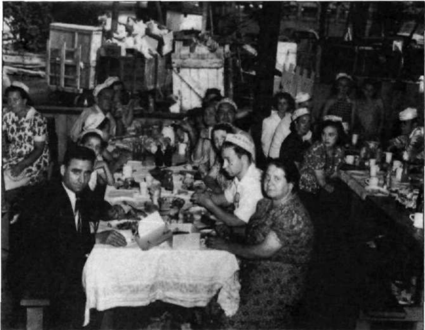
Initiated in 1937, the annual employees' picnic was an important ingredient in the 'Dofasco Way.'