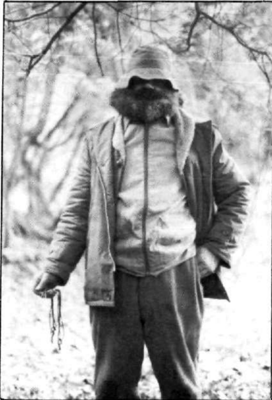
An Unexpropriated Romany Man Holding Rabbit Snares, Worcestershire, Winter 1979

This comes from a somewhat later period but in showing us some of what the Romany knew in order to survive, it can show what others might learn from them. 18