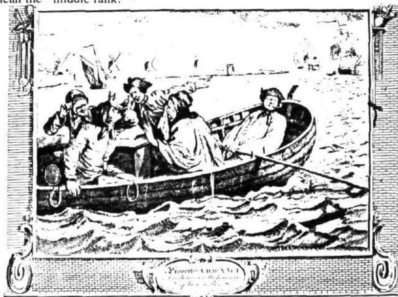
Tom Idle Goes to Sea, An Excerpt from William Hogarth