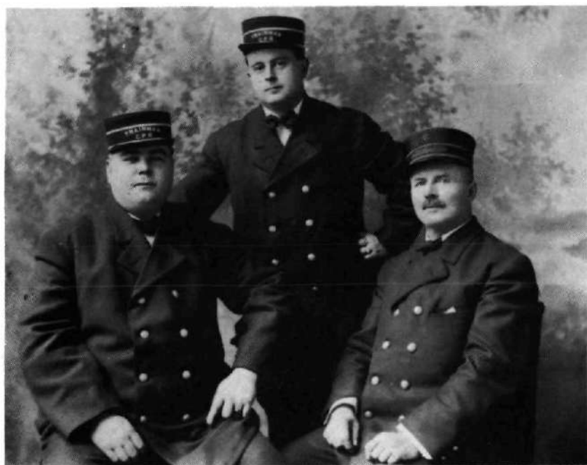
Group of CPR employees, c. 1911.

This expansion included Canada. The ORC entered the Dominion in 1880, and the BRT in 1885, and by the end of the decade, both unions had local branches from coast to coast on all three of the country's major railway systems, the Grand Trunk, the Canadian Pacific, and the Intercolonial. Although Canadians never made up more than seven per cent of the two brotherhoods' total membership, they proudly styled themselves as international organizations, and Canadian members enjoyed a certain prestige, if not influence, as living symbols of international status. 2 On their part, Canadian conductors and trainmen gradually developed a sense of loyalty to the brotherhoods which, as subsequent events were to prove, was stronger than any feelings of obligation they might have had for the companies which employed them, including the Canadian Pacific. 3