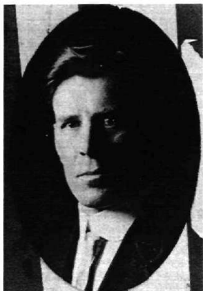
MLA Winnipeg.