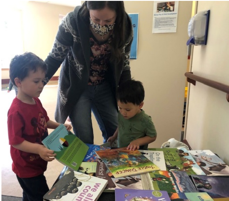
Figure 5. Preschoolers Choose Picture Books to take Home (used with permission)