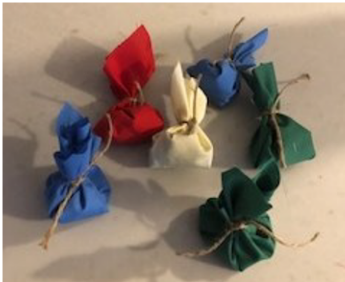
Figure 1. Tobacco Pouches as Cultural Protocol

discussion (Wilson, 2008) where the Advisory Circle had the final say in how study results were analyzed, interpreted, written, and shared to ensure they remained true to the voices of participants, true to cultural values, beliefs, and ways of knowing, that contributions were acknowledged and credited (collective or individual), and that sacred knowledge remained protected. As well, all aspects of the research project were conducted in accordance with the ethical standards set out in the Tri-Council Policy Statement: Ethical Conduct for Research Involving Humans (TCPS, 2022).