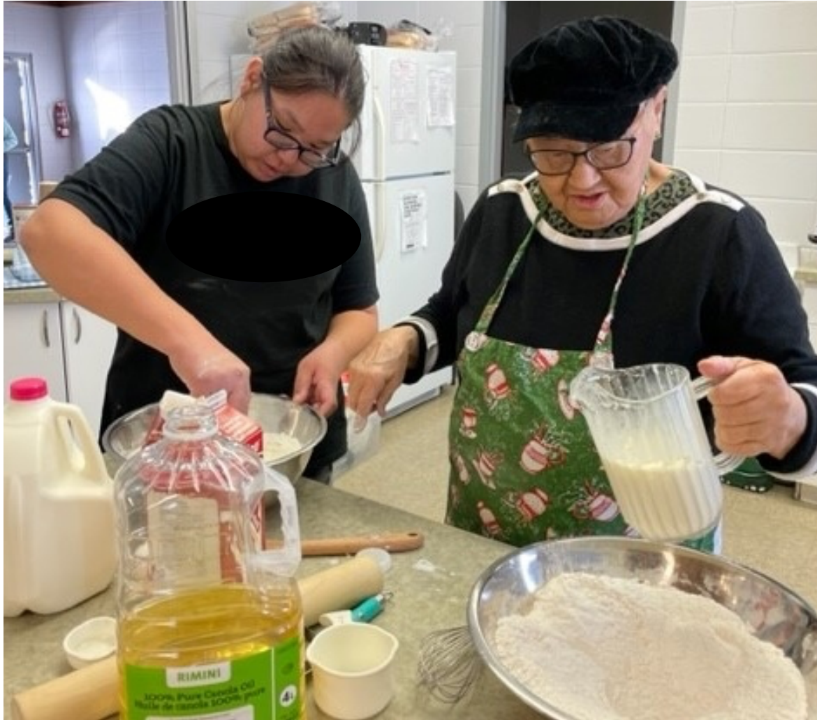
Figure 2. Modelling Bannock Making (used with permission)

Theme three also included recognizing and living embodied knowledge and practices such as oral storytelling and nature/land-based learning. The powerful connection between land and culture (and language) cannot be underestimated in Indigenous ways of knowing and participants shared many ideas related to this connection. For example, CK commented, “I feel like children learn more in nature than they would in school. In school, you have to sit down and learn it, but in nature, they get to go look at lady bugs and talk to lady bugs” (Interview). Simpson (2014) describes the idea of “land as pedagogy” as learning from the land and with the land in the context of family, community, language, and relations, where “if you want to learn about something, you need to take your body onto the land...get involved and get invested” (p. 17-18). Researcher participant observation at the preschool revealed ample, daily outside play and programming where they observed and discussed animals and seasonal changes, examined tree bark and rings, picked berries, talked to trees, and categorized stones as just a few examples. Found nature items were frequently gathered and brought into the classroom to be used in games and art activities, such as tipis, drums, rattles, hoops, rain sticks, or dream catchers, where the oral cultural histories and significance were always explained to the children in ways they could