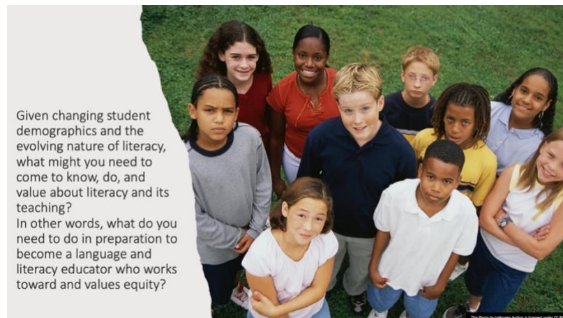
Figure 4. What Does It Mean to be a Skilled and Responsive Literacy Educator?