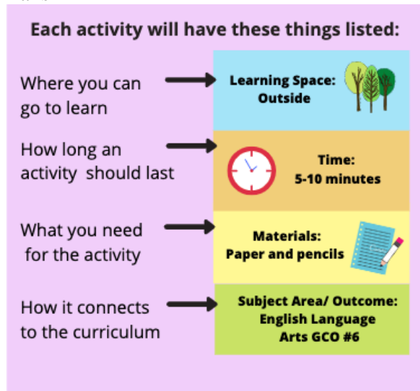
Figure 4. Explanation of Icons to Support Parents and Children in Co-navigating Lesson Plans

In addition to the icons and step by step instructions that guided parents and children through the lesson plans, the lessons included “options” that parents and children could choose to pursue. Some options could be accessed through hyperlinks to videos that explained different formats of poetry and word banks. Other options did not rely on technology and offered suggestions of additional poetry writing options using pencil/crayons and paper.