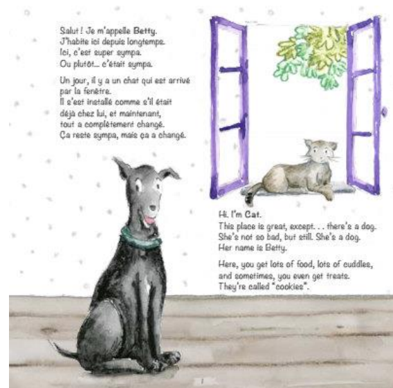
Figure 3. Cover and passage of Chez Betty & Cat at home (Jacobs & Duvernois, 2016)