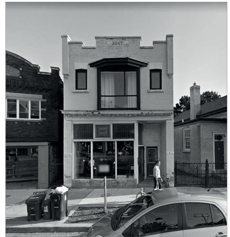
FIG. 2. MOSQUE ONE, 3047 DUNDAS ST W, TORONTO. | GOOGLE STREET VIEW, 2019, ACCESSED MARCH 3, 2020

in the same space with the men. Besides a prayer area, the mosque included a small library and a Sunday school, designed to help children to preserve their cultural and religious identity.<sup>10</sup>