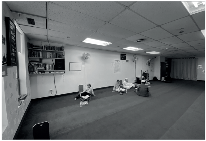
FIG. 6. DANFORTH ISLAMIC CENTRE (INTERIOR), 3018 DANFORTH AVE, EAST YORK. | SAADMAN AHMED, 2019.