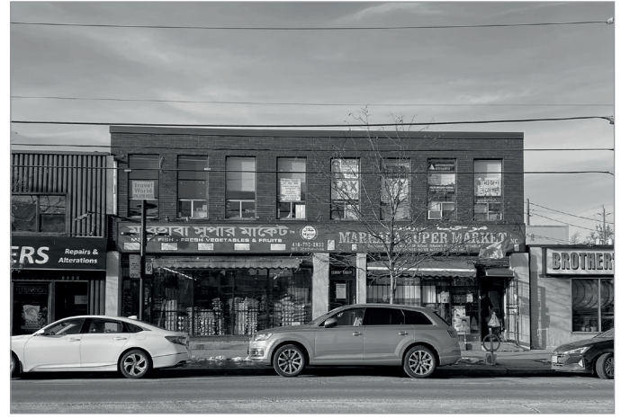
FIG. 5. DANFORTH ISLAMIC CENTRE (EXTERIOR), 3018 DANFORTH AVE, EAST YORK. | SAADMAN AHMED, 2019.