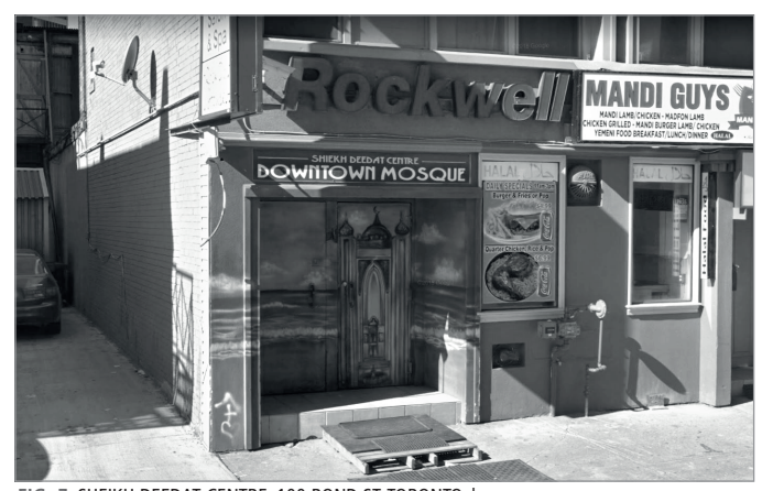
FIG. 7. SHEIKH DEEDAT CENTRE, 100 BOND ST, TORONTO.