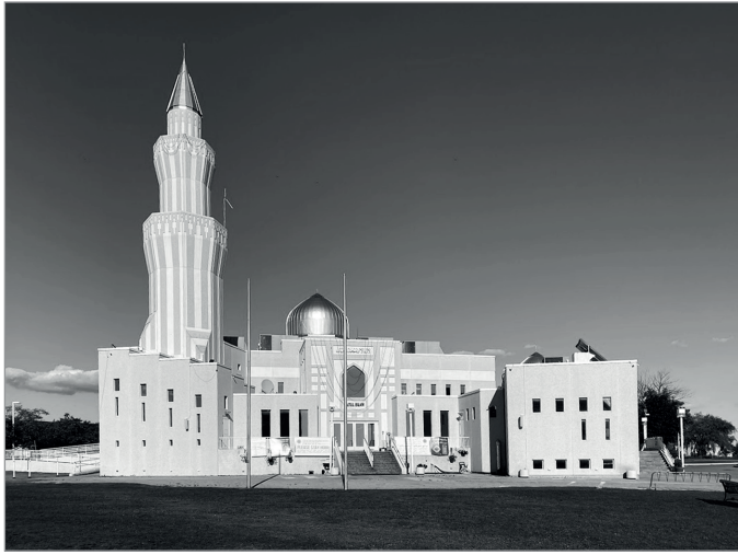
FIG. 3. NUGGET MOSQUE, 441 NUGGET AVE, SCARBOROUGH.