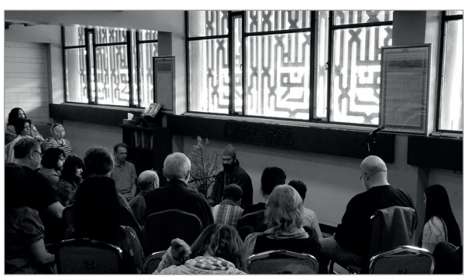
FIG. 12. NOOR CULTURAL CENTRE (INTERIOR), 123 WYNFORD DRIVE, NORTH YORK.

York, ON, we can begin to understand the need to create a Canadian identity for Muslims living and practicing their faith in Canada.