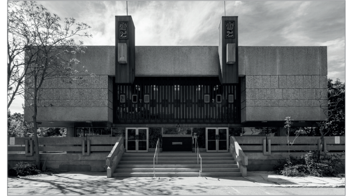
FIG. 11. NOOR CULTURAL CENTRE (EXTERIOR), 123 WYNFORD DRIVE, NORTH YORK.