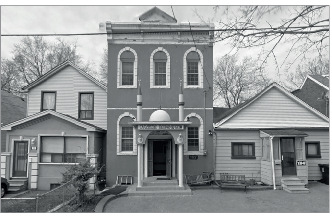
FIG. 8. FATIH MOSQUE, 182 RHODES AVE, TORONTO. | GOOGLE STREET VIEW, 2017, ACCESSED MARCH 15, 2020.

religious lectures, community centres, and often become cultural hubs for various events. Although repurposed mosques do not always express their culture through design, they nonetheless use parts of the idioms and ideas of traditional Islamic architecture and values, whether programmatically or contextually. Yet, this duality of repurposed mosques raises several questions: Do the repurposed mosques simply convey "an essentialized version of mosque architecture or do they successfully claim a sense of architectural authenticity?"<sup>23</sup> Are the subtle representations of culture behind the façades of