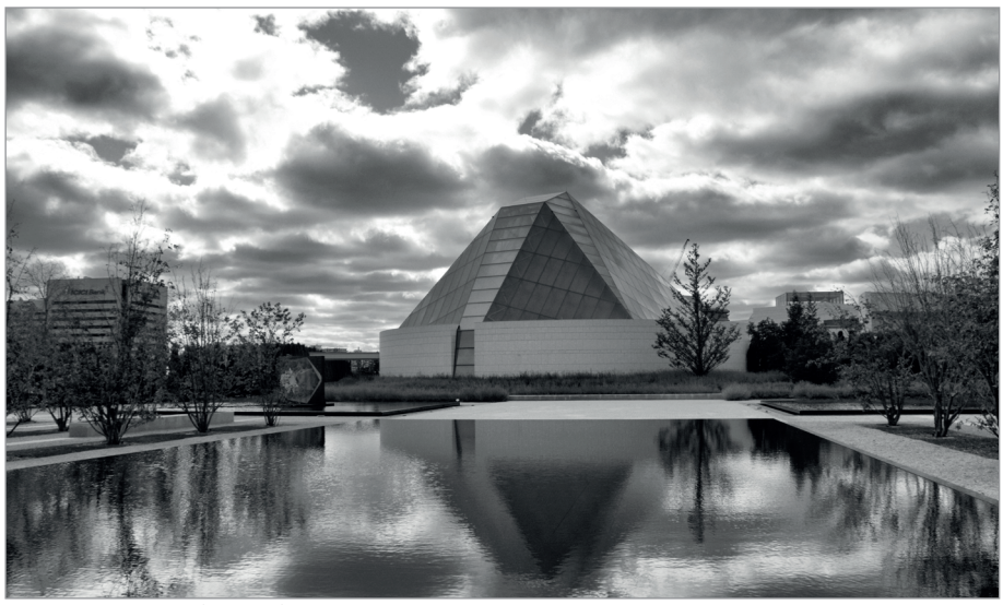
FIG. 9. ISMAILI CENTRE (EXTERIOR), 49 WYNFORD DRIVE, NORTH YORK.