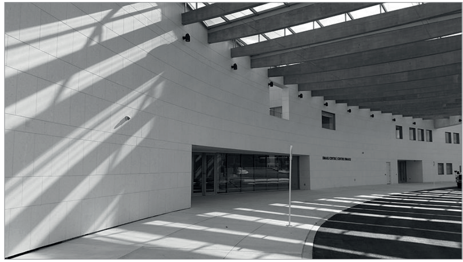
FIG. 10. ISMAILI CENTRE (ENTRANCE), 49 WYNFORD DRIVE, NORTH YORK.