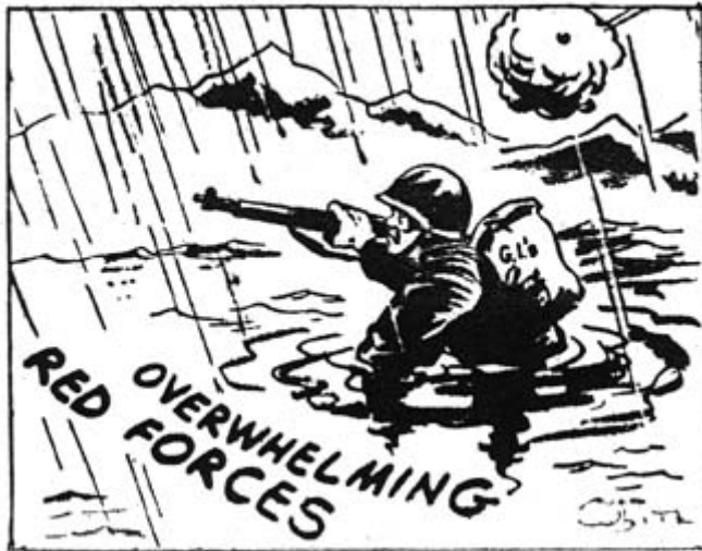
Figure 5 Situation Fluid Ned R. White, The Akron Beacon Journal

The themes of editorial art included domestic concerns within two weeks of the war's outbreak. Adjacent to a story titled "War Strains Expose Economy's 'Soft Spots,' The Pressing Problem is How to Avoid Inflation Without Harsh Controls" that reflected a fear of returning economic woes, was the "Breathing Down His Neck" image of Figure 6. 20 This shows the problems government leaders faced in trying to reduce taxes with the expenses of a new overseas war looming in the background, as well as the public's anxiety over the war's possible effects on them as citizens.