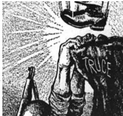
Figure 9 Resistance on the Last Ridge Don Hesse, St. Louis Globe-Democrat

By mid-1953, when peace talks were finally coming to fruition, South Korean President Syngman Rhee was often depicted as the major obstacle to achieving results. He adamantly was opposed to accepting any plan that did not reunify Korea and actually worked to undo the armistice on the eve of final agreements. 31 In Figure 9, "Resistance on the Last Ridge," Rhee's interference was characterized as significant enough to destroy the entire truce. 32