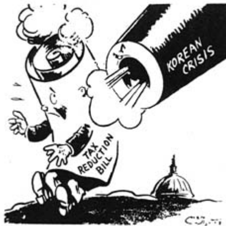
Breathing Down His Neck Ned R. White The Akron Beacon Journal

The themes of editorial art included domestic concerns within two weeks of the war's outbreak. Adjacent to a story titled "War Strains Expose Economy's 'Soft Spots,' The Pressing Problem is How to Avoid Inflation Without Harsh Controls" that reflected a fear of returning economic woes, was the "Breathing Down His Neck" image of Figure 6. 20 This shows the problems government leaders faced in trying to reduce taxes with the expenses of a new overseas war looming in the background, as well as the public's anxiety over the war's possible effects on them as citizens.