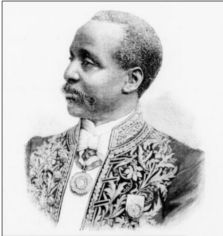
Figure 1. Joseph Anténor Firmin on the cover of Le Moniteur .