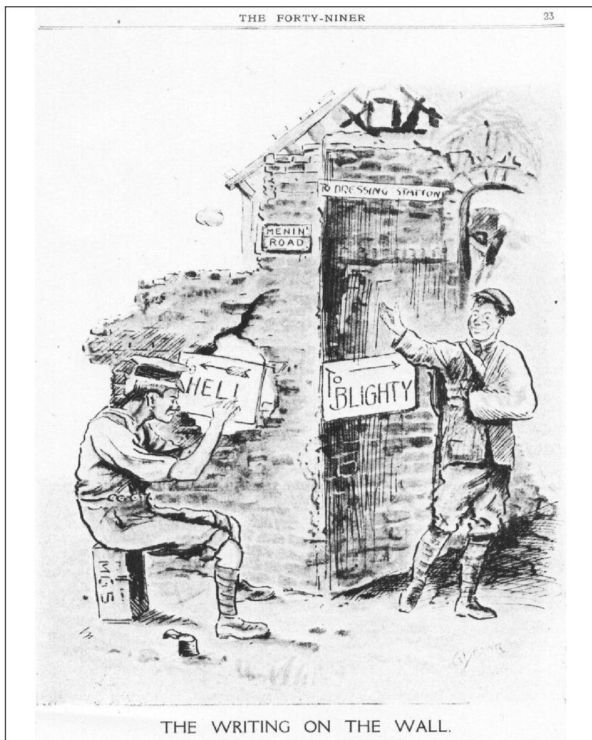
The Writing on the Wall