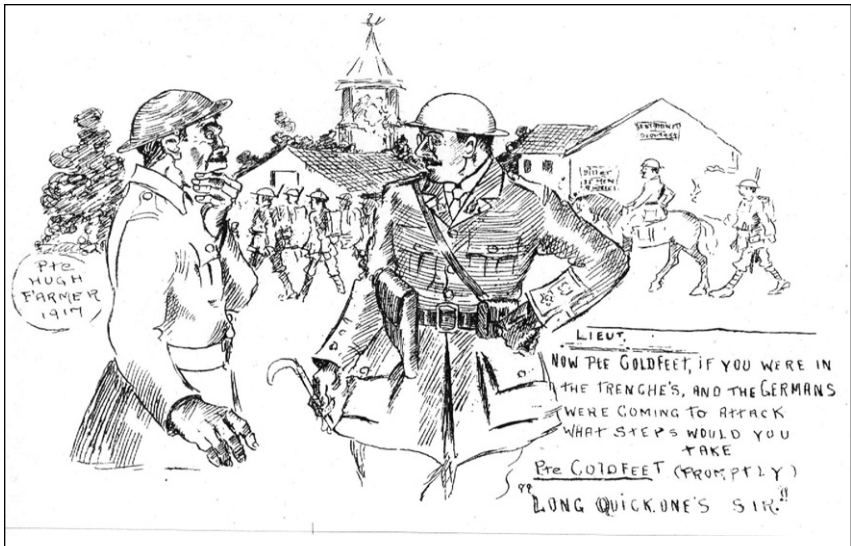
Private Cold feet

“Long quick one’s [sic] sir.” 52 To those not a part of the soldiers’ culture, anti-heroic actions, gallows humour, and biting satire were sometimes misconstrued as soldiers looking to abandon the war effort. Had the army been reduced to cowards? Had rot set in to the once proud fighting forces? While it might have been true for some soldiers close to succumbing to the stress of combat, most understood their role in the war and were not anxious to leave their mates in the lurch. Anti-heroes helped the soldiers deal with the strain engendered by the boredom, banality, and brutality of trench warfare. These cultural figures were also a reflection of inner anxieties and deep-set wishes, which were not always acted upon, but provided a vicarious outlet for many of the expressions and actions prevalent among most soldiers at the front. One should be wary of unifying themes in cultural history; the messiness and inconsistencies of conflicting issues need to be acknowledged and teased out. Soldiers could despise civilians one day and write pining letters to loved ones at home the next; they could turn their nose down at the “eye wash” emanating from ultra-patriotic papers and then turn to those same newspapers to understand what was happening at the front; they could be dodging shells one minute and then, after clearing the wreckage of a trench or helping a bloodied companion to the rear, return to collect the same shell bits as trophies or souvenirs. Heroes could be