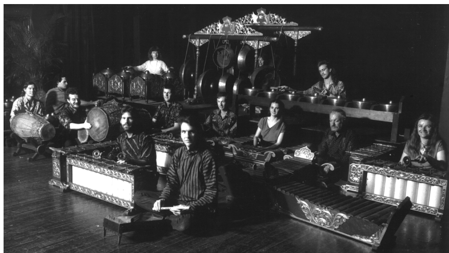
Figure 1. Gamelan Madu Sari in rehearsal at Simon Fraser University ca. 1988.

institution that formerly acquired the Javanese gamelan from the Indonesian government following the events of Expo 86. Meanwhile, the Western Front, already sympathetic to Indonesian arts, 5 hosted a night of Javanese shadow puppetry, which would be instrumental in SFU's acquisition of the instruments. Although the two differ greatly in nature, a crucial link between both institutions is their dedication to the interdisciplinary arts. 6