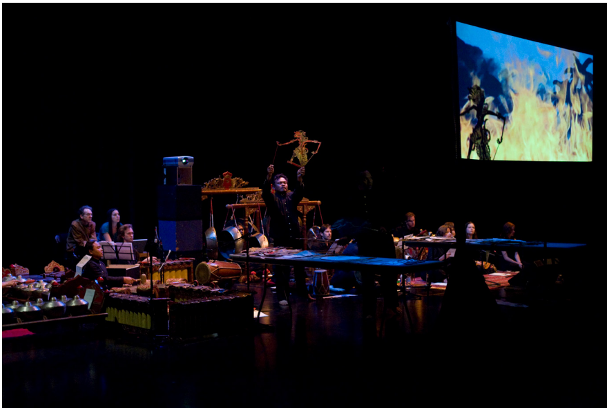
Figure 5. Gamelan Madu Sari performing “Semar in Lila Maya” in Vancouver with members from Wargo Laras.

gamelan, he was already exposed to two streams of musical output: karawitan (traditional music for gamelan) and new compositions.