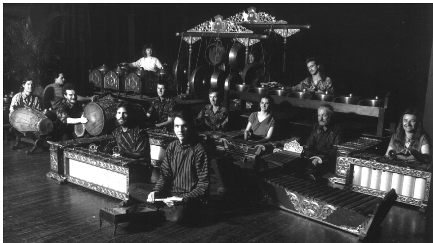
Figure 1. Gamelan Madu Sari in rehearsal at Simon Fraser University ca. 1988.

institution that formerly acquired the Javanese gamelan from the Indonesian government following the events of Expo 86. Meanwhile, the Western Front, already sympathetic to Indonesian arts, 5 hosted a night of Javanese shadow puppetry, which would be instrumental in SFU's acquisition of the instruments. Although the two differ greatly in nature, a crucial link between both institutions is their dedication to the interdisciplinary arts. 6