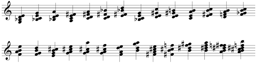
Figure 12. Gan Eden “paradise music” structure

orchestral work Into the Distant Stillness with the same significance of evoking paradise.