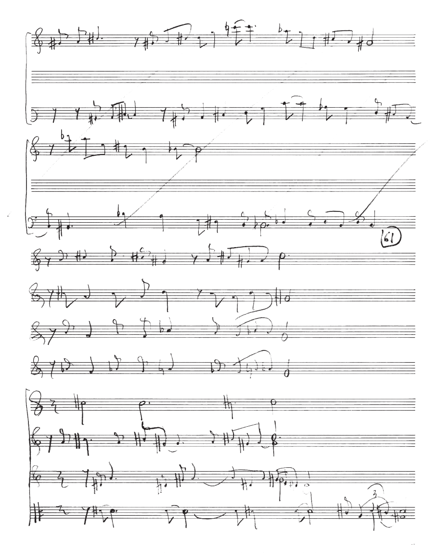
Example 3. Various treatments of instrumental ideas from Anhalt's Oppenheimer sketches (file D1.91, box 60, MUS 164, Libraries and Archives Canada)