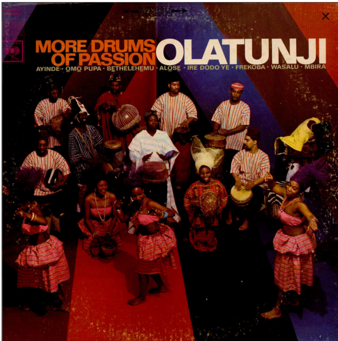
Figure 1. Album covers for Olatunji's Drums of Passion (1960) and More Drums of Passion (1966)