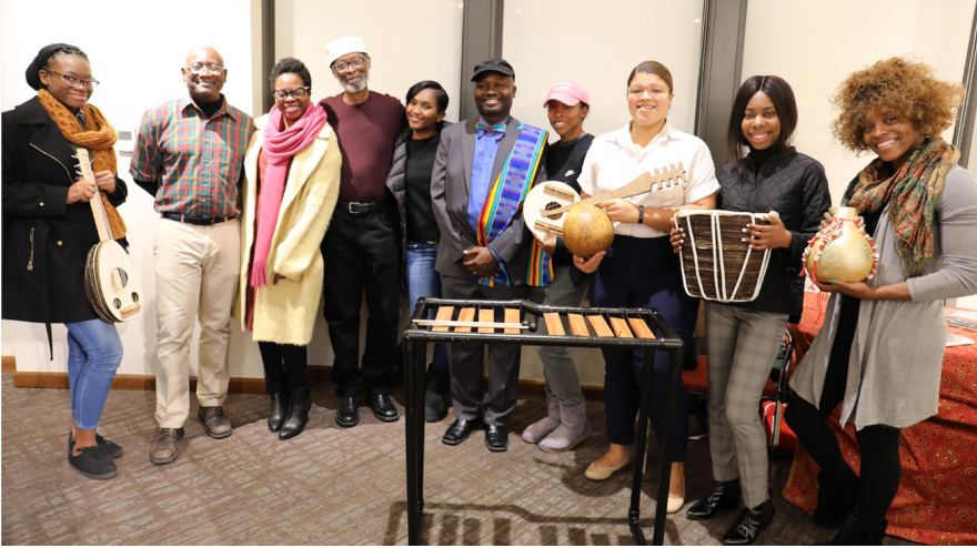
Figure 3. Spelman students and faculty with exhibit organizers at the “Black Money” exhibit, November 2018.