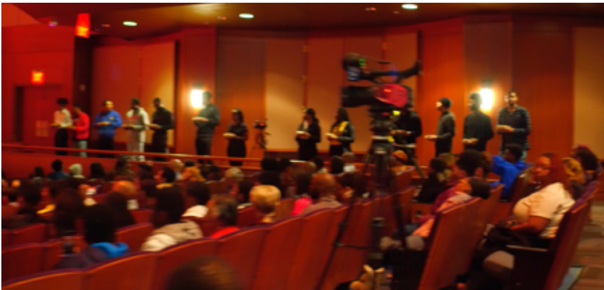
Figure 8: Africana Music Experience concert: general education students playing instruments they made ( top and bottom ); Morehouse Glee Club and Afro Pop Ensemble and guest artists ( centre ) all performing “Lithisikiya,” an anti-apartheid song in three indigenous languages of South Africa: Xhosa, Zulu, and Sotho.