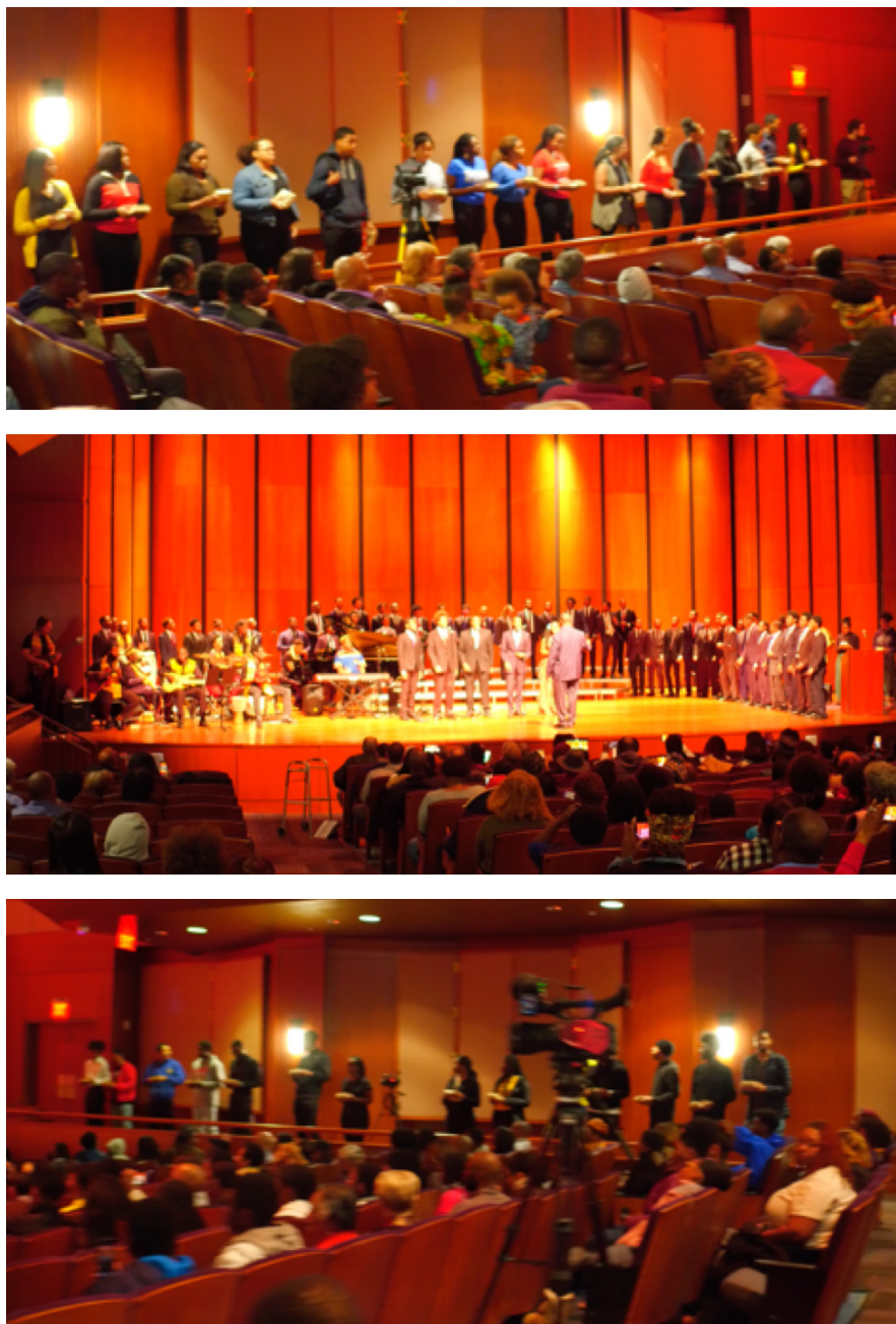
Figure 8: Africana Music Experience concert: general education students playing instruments they made ( top and bottom ); Morehouse Glee Club and Afro Pop Ensemble and guest artists ( centre ) all performing “Lithisikiya,” an anti-apartheid song in three indigenous languages of South Africa: Xhosa, Zulu, and Sotho.