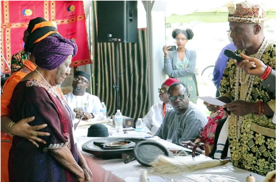
Figure 2. 2018 Ìgbò Reconnection Ceremony in Staunton, VA.

different in the twenty-first century than in the 1950s and 1960s when Pan-Africanism (Black solidarity) was so essential for African independence and civil rights movements. Identity formation around ethnic heritage for African Americans has been transformed through DNA testing. An example of this move to ethnic recognition is the annual Ìgbò Reconnection Ceremonies in Staunton, Virginia, and Chicago, in which DNA-tested African Americans are re-initiated into the Ìgbò ethnic group through a naming ceremony. The event is focused on people of Ìgbò descent and prioritizes their reconnection, but also welcomes people not of Ìgbò descent, and the 2018 ceremony welcomed a young white male to the Ìgbò community. Thus, even white people who want to associate with Africa are being more ethnically specific instead of pan-African. Focusing on understanding and appreciating a single ethnic group avoids essentialism.