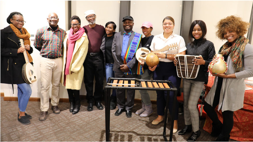
Figure 3. Spelman students and faculty with exhibit organizers at the “Black Money” exhibit, November 2018.