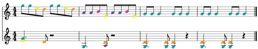
Figure 6. Ùbó-ákà ( Ìgbò name for lamellaphone) duet, composed by Quintina Carter-Ènyi

A wide variety of performance activities, both ethnically specific and eclectic, may be engaged once the instrument has been tuned and, optionally, a pickup installed. Figure 6 is an example of a duet that Quintina composed for students based on Ìgbò melodic and rhythmic motives. This has been used consistently with general education students, many with no prior musical training.